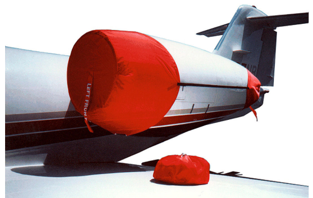
Lear 35 Engine Covers