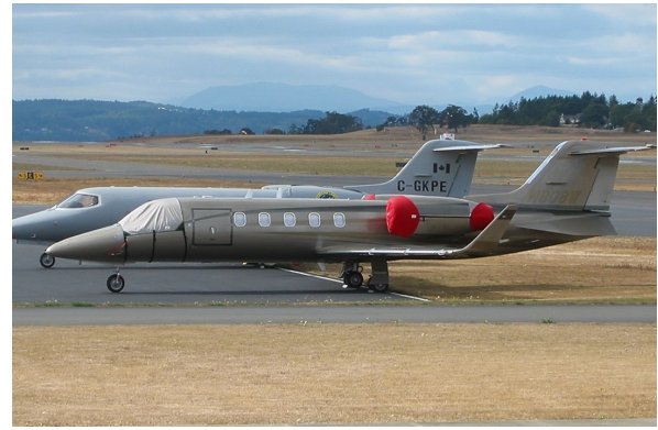
Lear 31A Cockpit Cover, Engine Covers