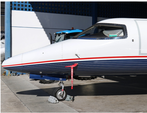
Lear Pitot Cover

The Engine Inlet Plugs are custom fit for your Lear 24 & 25 intakes, made with heavy-duty vinyl material, and stuffed with a single block of sculpted urethane foam. Each plug has a zipper that allows the foam to be removed and dried if necessary. Engine plugs have 'remove before flight' streamers sewn onto the face of the plugs. Most plugs are imprinted with the aircraft registration number in black for an extra charge. Storage bag NOT included. Engine plugs may be inserted after flight when the engine is still warm. Engine Inlet Plugs are commonly referred to as Cowl Plugs, Intake Plugs, Cowl Blocks, Engine Blocks, and Engine Bungs.