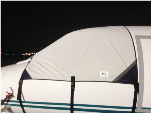
Lear 31 Cockpit Cover