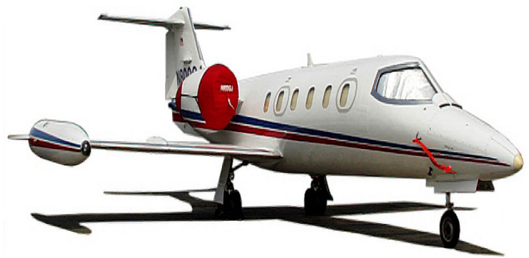
Lear 35 Engine Covers, Pitot Covers & Cockpit HeatShields