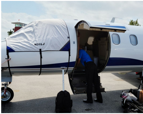
Lear 31A Cockpit Cover