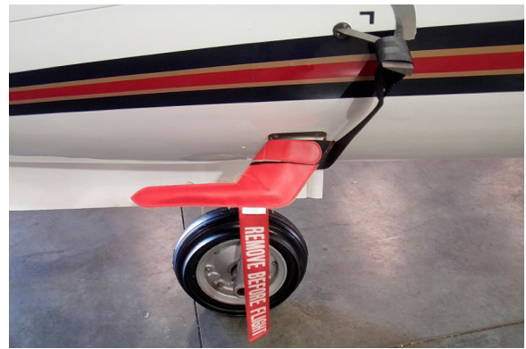
Learjet Heat Resistant Pitot Cover and AOA Strap