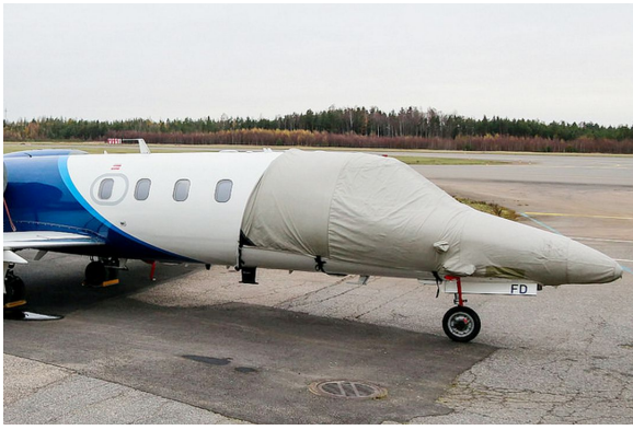
Learjet Cockpit/Nose Cover