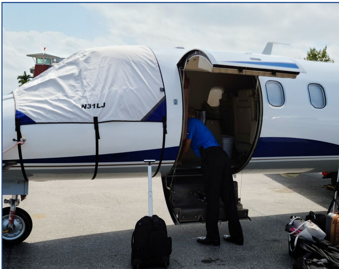
Lear 31A Cockpit Cover