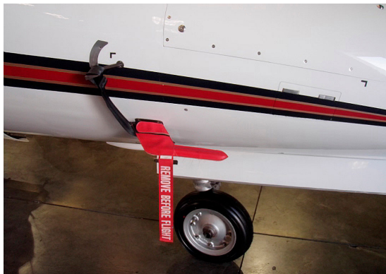
Learjet Heat Resistant Pitot Cover with AOA strap

The Engine Inlet Plugs are custom fit for your Lear 24 & 25 intakes, made with heavy-duty vinyl material, and stuffed with a single block of sculpted urethane foam. Each plug has a zipper that allows the foam to be removed and dried if necessary. Engine plugs have 'remove before flight' streamers sewn onto the face of the plugs. Most plugs are imprinted with the aircraft registration number in black for an extra charge. Storage bag NOT included. Engine plugs may be inserted after flight when the engine is still warm. Engine Inlet Plugs are commonly referred to as Cowl Plugs, Intake Plugs, Cowl Blocks, Engine Blocks, and Engine Bungs.