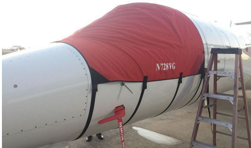
Learjet 45 Cockpit Cover

Travel Covers are made with Silver Solution-Dyed Polyester fabric and only lined over the windshield to save weight. The material is lightweight and more compact for easy stowage in the aircraft. The polyester material is water resistant, but only intended for occasional use outside. We also have an ultra lightweight material available for fitted hangar dust covers. For daily outdoor use, the non-travel Sunbrella Cover is the best choice.