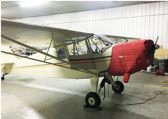
Taylorcraft DC-65 Insulated Engine Cover

This cover type is made from Silver Acrylic Sunbrella canvas and is 100% lined with a soft and smooth microfiber. Bruce's Custom Covers developed this material combination especially for aircraft protection. The outer material is medium weight and treated for water resistance, UV resistance and anti-static buildup. The inner lining is a very soft and smooth microfiber to prevent scratching. The material is very reflective, and tests show that the cabin interior temperature can be reduced to near-ambient temperature on the hottest of days. It is water, ice and snow repellent, yet breathable to allow moisture to escape from between the cover and the aircraft surface.