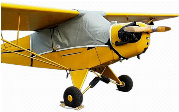
Piper J3 Canopy Cover