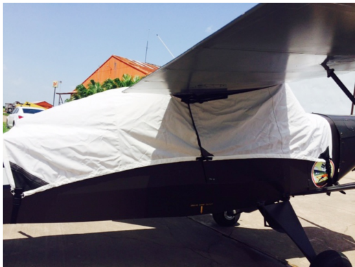
Taylorcraft L-2 Canopy Cover

This cover type is made from Silver Acrylic Sunbrella canvas and is 100% lined with a soft and smooth microfiber. Bruce's Custom Covers developed this material combination especially for aircraft protection. The outer material is medium weight and treated for water resistance, UV resistance and anti-static buildup. The inner lining is a very soft and smooth microfiber to prevent scratching. The material is very reflective, and tests show that the cabin interior temperature can be reduced to near-ambient temperature on the hottest of days. It is water, ice and snow repellent, yet breathable to allow moisture to escape from between the cover and the aircraft surface.