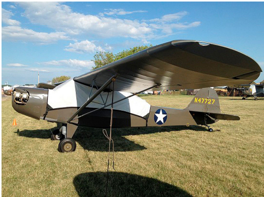
Taylorcraft L-2 Canopy Cover

This cover type is made from Silver Acrylic Sunbrella canvas and is 100% lined with a soft and smooth microfiber. Bruce's Custom Covers developed this material combination especially for aircraft protection. The outer material is medium weight and treated for water resistance, UV resistance and anti-static buildup. The inner lining is a very soft and smooth microfiber to prevent scratching. The material is very reflective, and tests show that the cabin interior temperature can be reduced to near-ambient temperature on the hottest of days. It is water, ice and snow repellent, yet breathable to allow moisture to escape from between the cover and the aircraft surface.