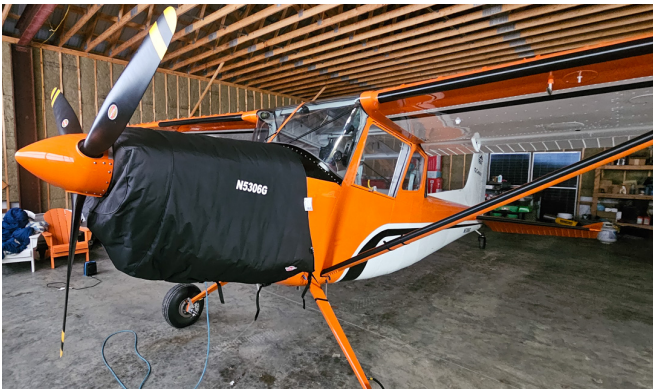
Cessna Bird Dog, L-19, O-1, 305 Insulated Engine Cover

This cover type is made from Silver Acrylic Sunbrella canvas and is 100% lined with a soft and smooth microfiber. Bruce's Custom Covers developed this material combination especially for aircraft protection. The outer material is medium weight and treated for water resistance, UV resistance and anti-static buildup. The inner lining is a very soft and smooth microfiber to prevent scratching. The material is very reflective, and tests show that the cabin interior temperature can be reduced to near-ambient temperature on the hottest of days. It is water, ice and snow repellent, yet breathable to allow moisture to escape from between the cover and the aircraft surface.