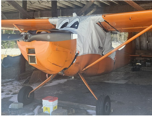
Cessna L-19 Canopy Cover, over top type

This cover type is made from Silver Acrylic Sunbrella canvas and is 100% lined with a soft and smooth microfiber. Bruce's Custom Covers developed this material combination especially for aircraft protection. The outer material is medium weight and treated for water resistance, UV resistance and anti-static buildup. The inner lining is a very soft and smooth microfiber to prevent scratching. The material is very reflective, and tests show that the cabin interior temperature can be reduced to near-ambient temperature on the hottest of days. It is water, ice and snow repellent, yet breathable to allow moisture to escape from between the cover and the aircraft surface.