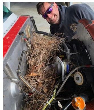
Cessna 172 Bird Nest Problem