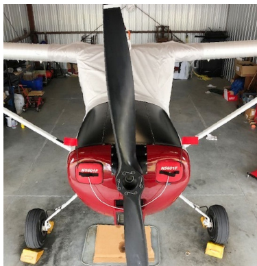
Cessna Bird Dog, L-19, O-1, 305 Engine Inlet Plugs