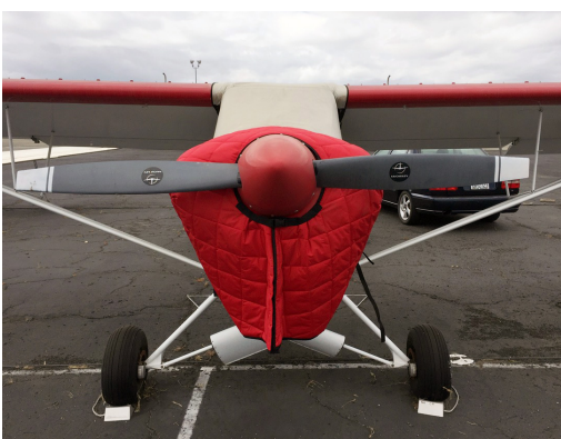
Insulated Hangar Blanket on Cessna 182 FOR INTERIOR USE. Cub Crafters CC-11 Insulated Hangar Blanket, available in Red or Silver