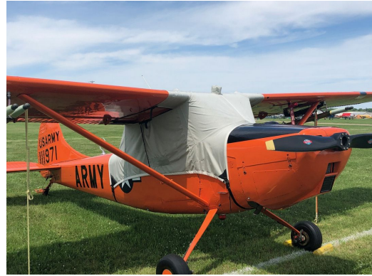
Cessna L-19 Bird Dog Over-Top Canopy Cover