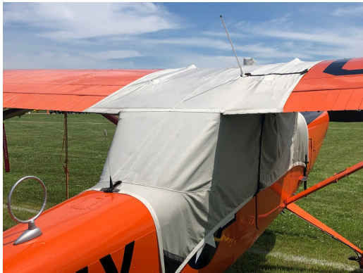
Cessna L-19 Bird Dog Over-Top Canopy Cover