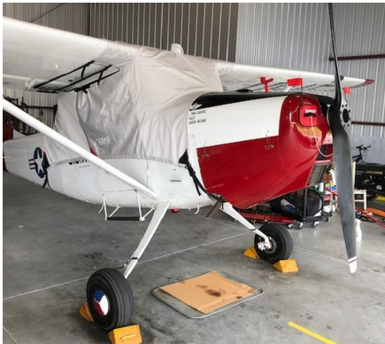
Cessna Bird Dog, L-19, O-1, 305 Canopy Cover, Over-Top Type