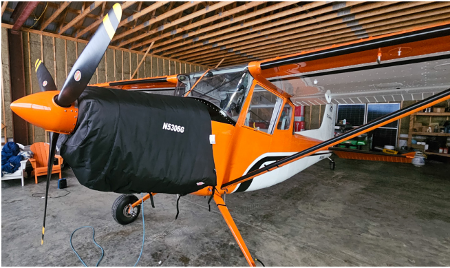
Cessna Bird Dog, L-19, O-1, 305 Insulated Engine Cover

This cover type is made from Silver Acrylic Sunbrella canvas and is 100% lined with a soft and smooth microfiber. Bruce's Custom Covers developed this material combination especially for aircraft protection. The outer material is medium weight and treated for water resistance, UV resistance and anti-static buildup. The inner lining is a very soft and smooth microfiber to prevent scratching. The material is very reflective, and tests show that the cabin interior temperature can be reduced to near-ambient temperature on the hottest of days. It is water, ice and snow repellent, yet breathable to allow moisture to escape from between the cover and the aircraft surface.