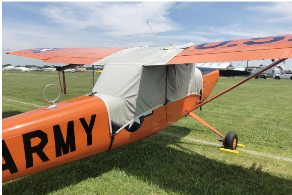
Cessna L-19 Bird Dog Canopy Cover

This cover type is made from Silver Acrylic Sunbrella canvas and is 100% lined with a soft and smooth microfiber. Bruce's Custom Covers developed this material combination especially for aircraft protection. The outer material is medium weight and treated for water resistance, UV resistance and anti-static buildup. The inner lining is a very soft and smooth microfiber to prevent scratching. The material is very reflective, and tests show that the cabin interior temperature can be reduced to near-ambient temperature on the hottest of days. It is water, ice and snow repellent, yet breathable to allow moisture to escape from between the cover and the aircraft surface.