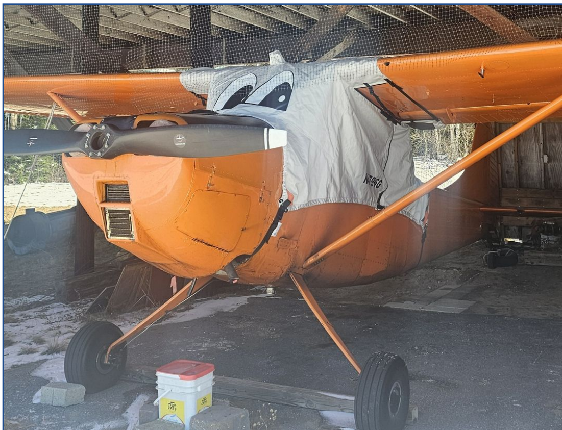
Cessna L-19 Canopy Cover, over top type