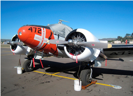
Beech 18 Cockpit Cover and Carb Air Inlet Plugs