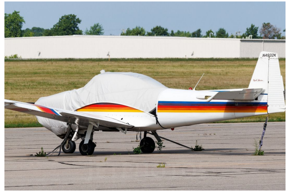
Navion Canopy Cover, Engine Cover (fully enclosed)