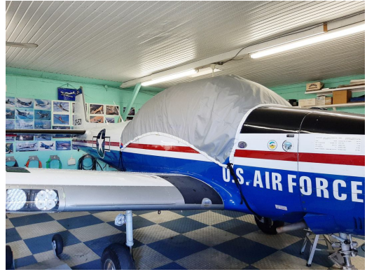
Navion L-17 Travel Cover, Light Weight Canopy Cover (w/without avionics bay extension)