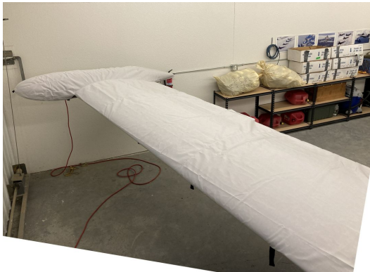
Navion Rangemaster Wing Covers

WINTER USE MATERIAL - Made with Solution-Dyed Polyester fabric, this option is intended for seasonal use to aid in deicing, rain mitigation, or for occasional travel. The material is lighter and more compact, but more susceptible to UV damage and may have a shorter useful life if used continuously outside than the all-year use material.