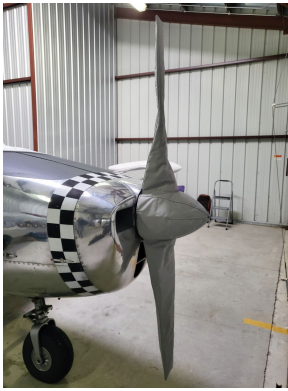
Navion L-17 Insulated Propellor/Spinner Cover, 2 Blade