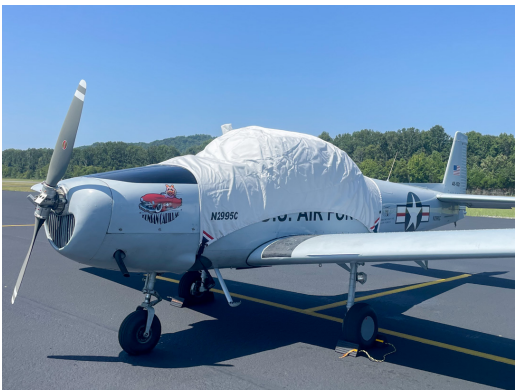
Navion L-17B Canopy Cover (With Avionics Bay Extension)