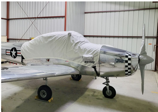
Navion L-17 Canopy Cover (With Avionics Bay Extension)

This cover type is made from Silver Acrylic Sunbrella canvas and is 100% lined with a soft and smooth microfiber. Bruce's Custom Covers developed this material combination especially for aircraft protection. The outer material is medium weight and treated for water resistance, UV resistance and anti-static buildup. The inner lining is a very soft and smooth microfiber to prevent scratching. The material is very reflective, and tests show that the cabin interior temperature can be reduced to near-ambient temperature on the hottest of days. It is water, ice and snow repellent, yet breathable to allow moisture to escape from between the cover and the aircraft surface.