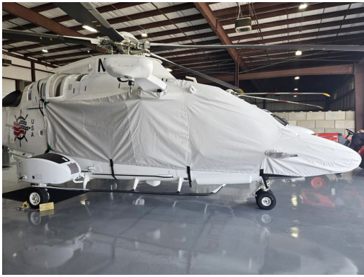
Agusta AW169 Bubble Cover