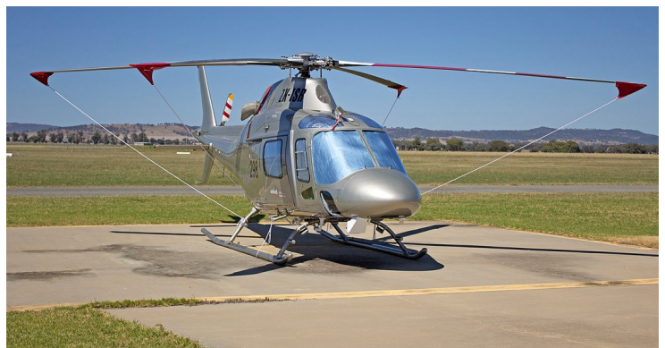
Agusta 119 Cockpit/Cabin HeatShields