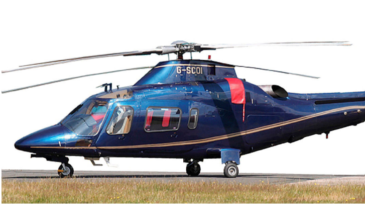
Agusta Power Intake Cover