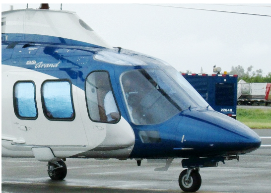
Agusta Grand Cabin & Skylight HeatShields

Cabin Heatshields are interior sunshades for the aircraft's passenger cabin area. The product is a unique composite of closed-cell foam with a silver mylar finish. The semi-rigid design is stiff enough to stand inside the window framing. The set folds up flat and is easily stored in the included storage sleeve. Some designs may require velcro and suction cups. A Heatshield is an excellent short-term remedy for cockpit overheating, but an external fabric cover is more effective for long-term protection.