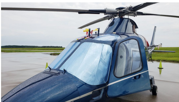
Agusta AW109S/SP Grand Heatshield Set

Cabin Heatshields are interior sunshades for the aircraft's passenger cabin area. The product is a unique composite of closed-cell foam with a silver mylar finish. The semi-rigid design is stiff enough to stand inside the window framing. The set folds up flat and is easily stored in the included storage sleeve. Some designs may require velcro and suction cups. A Heatshield is an excellent short-term remedy for cockpit overheating, but an external fabric cover is more effective for long-term protection.