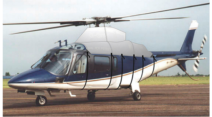
Agusta Power Engine Cover (illustration)