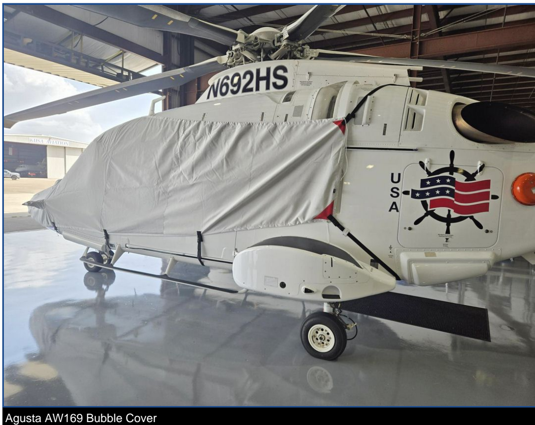
Agusta AW169 Bubble Cover