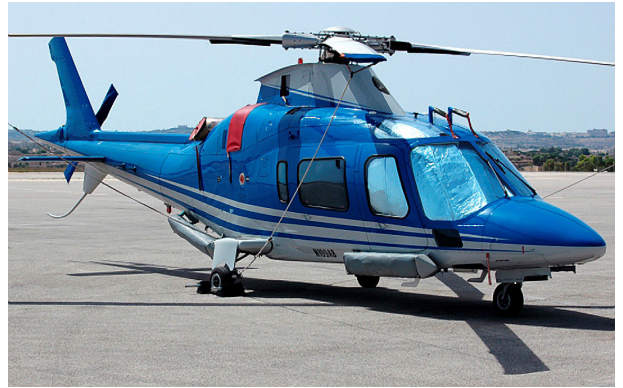
Agusta Power Cockpit HeatShields & Blade Tie-downs