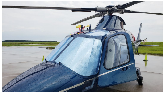
Agusta AW109S/SP Grand Heatshield Set