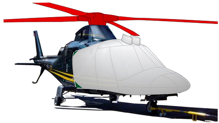
Agusta 109 Bubble, Rotor Hub & Blade Covers (illustration)