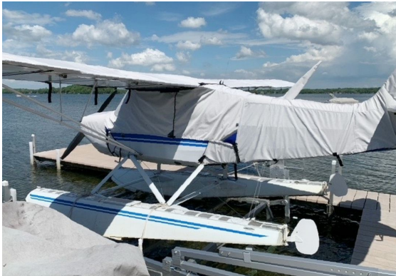
Aeronca 7GC Amphib Cover Set