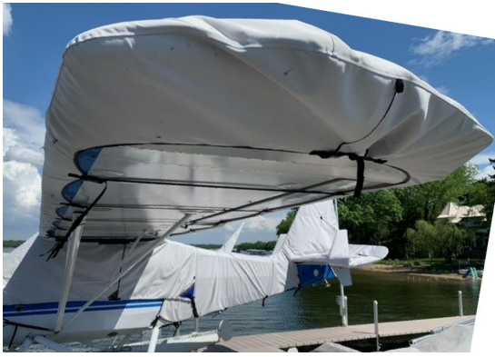
Aeronca 7GC Amphib Cover Set