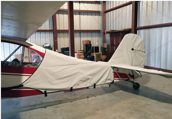
Aeronca Champ Canopy, Wings, Engine & Empennage (test fit) Covers