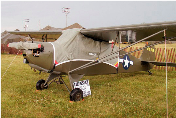
Aeronca 7AC Champ Canopy & Prop Covers

This cover type is made from Silver Acrylic Sunbrella canvas and is 100% lined with a soft and smooth microfiber. Bruce's Custom Covers developed this material combination especially for aircraft protection. The outer material is medium weight and treated for water resistance, UV resistance and anti-static buildup. The inner lining is a very soft and smooth microfiber to prevent scratching. The material is very reflective, and tests show that the cabin interior temperature can be reduced to near-ambient temperature on the hottest of days. It is water, ice and snow repellent, yet breathable to allow moisture to escape from between the cover and the aircraft surface.