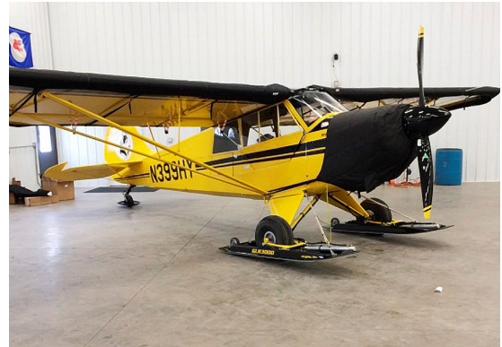
Aviat Husky Insulated Engine Cover, Wing Covers