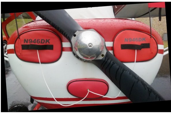
Aeronca Champ Engine Plugs