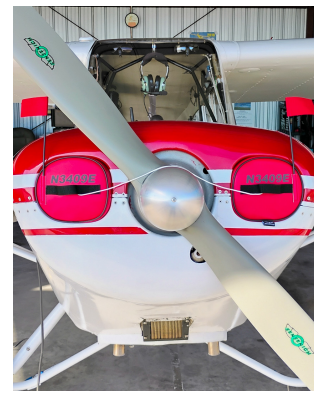
Aeronca 7AC Engine Inlet Plugs