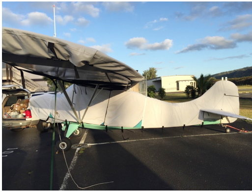
Aeronca 7AC Full Cover Set