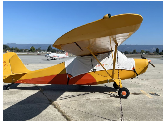
Aeronca Champ 7AC Over-Top Canopy Cover