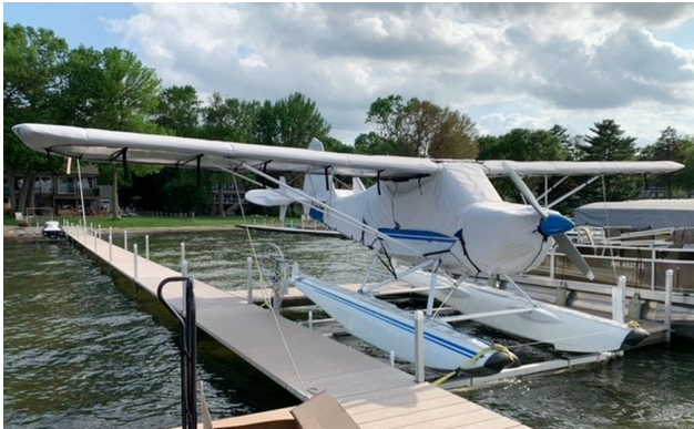
Aeronca 7GC Amphib Cover Set

This cover type is made from Silver Acrylic Sunbrella canvas and is 100% lined with a soft and smooth microfiber. Bruce's Custom Covers developed this material combination especially for aircraft protection. The outer material is medium weight and treated for water resistance, UV resistance and anti-static buildup. The inner lining is a very soft and smooth microfiber to prevent scratching. The material is very reflective, and tests show that the cabin interior temperature can be reduced to near-ambient temperature on the hottest of days. It is water, ice and snow repellent, yet breathable to allow moisture to escape from between the cover and the aircraft surface.