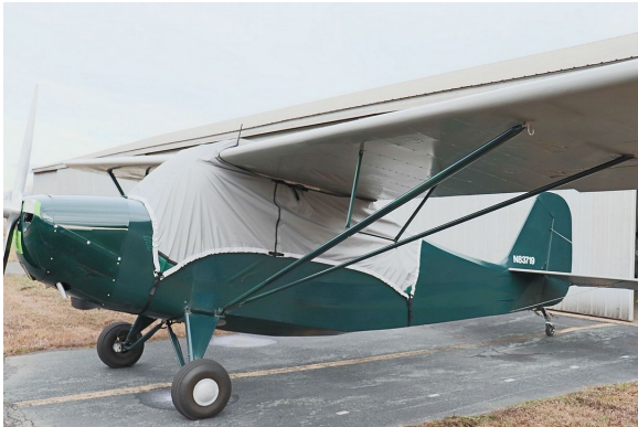
Aeronca 7AC Over-Top Canopy Cover, Light Weight Travel Type