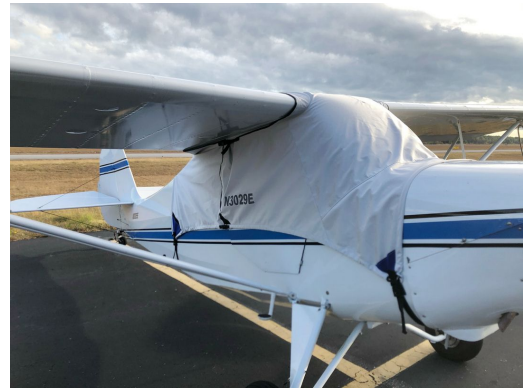
Aeronca 7AC Over The Top Style Canopy Cover