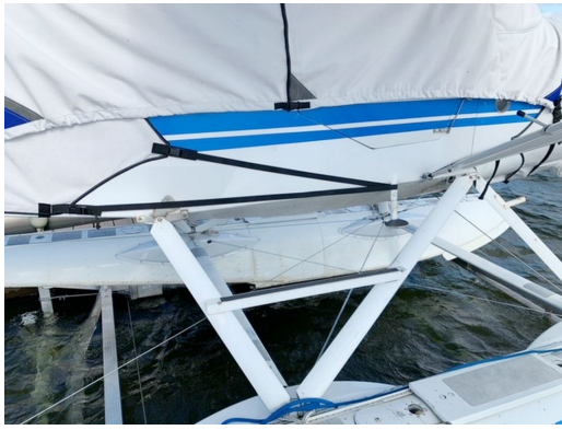
Aeronca 7GC Amphib Cover Set