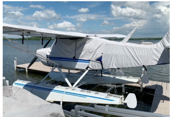
Aeronca 7GC Amphib Cover Set