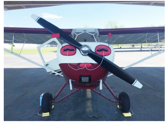
Aeronca Champ 7AC, 7EC Engine Inlet Plugs