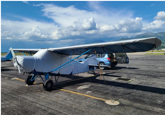
Champion 7EC Complete Cover Set

WINTER USE MATERIAL - Made with Solution-Dyed Polyester fabric, this option is intended for seasonal use to aid in deicing, rain mitigation, or for occasional travel. The material is lighter and more compact, but more susceptible to UV damage and may have a shorter useful life if used continuously outside than the all-year use material.