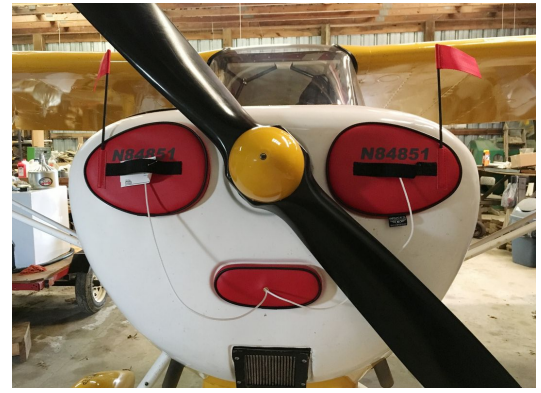
Aeronca 7AC Engine Inlet Plugs