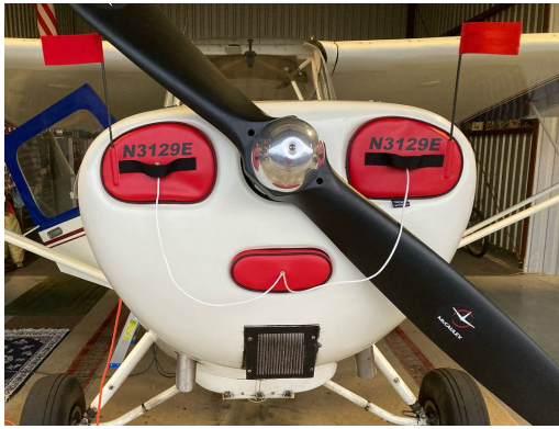
Aeronca Champ Engine Plugs