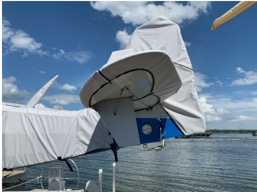
Aeronca 7GC Amphib Cover Set

This cover type is made from Silver Acrylic Sunbrella canvas and is 100% lined with a soft and smooth microfiber. Bruce's Custom Covers developed this material combination especially for aircraft protection. The outer material is medium weight and treated for water resistance, UV resistance and anti-static buildup. The inner lining is a very soft and smooth microfiber to prevent scratching. The material is very reflective, and tests show that the cabin interior temperature can be reduced to near-ambient temperature on the hottest of days. It is water, ice and snow repellent, yet breathable to allow moisture to escape from between the cover and the aircraft surface.