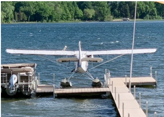
Aeronca 7GC Amphib Cover Set

WINTER USE MATERIAL - Made with Solution-Dyed Polyester fabric, this option is intended for seasonal use to aid in deicing, rain mitigation, or for occasional travel. The material is lighter and more compact, but more susceptible to UV damage and may have a shorter useful life if used continuously outside than the all-year use material.