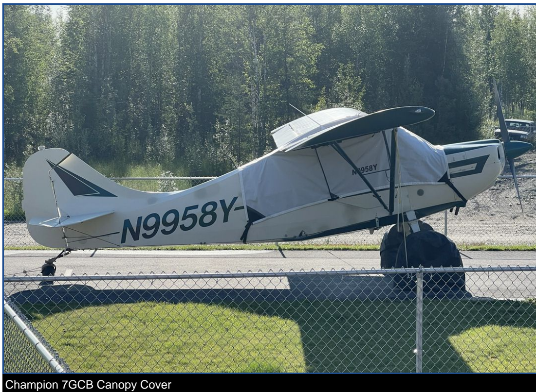
Champion 7GCB Canopy Cover