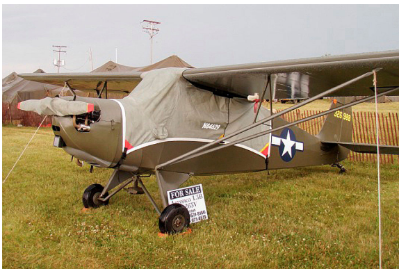
Aeronca 7AC Champ Canopy & Prop Covers

This cover type is made from Silver Acrylic Sunbrella canvas and is 100% lined with a soft and smooth microfiber. Bruce's Custom Covers developed this material combination especially for aircraft protection. The outer material is medium weight and treated for water resistance, UV resistance and anti-static buildup. The inner lining is a very soft and smooth microfiber to prevent scratching. The material is very reflective, and tests show that the cabin interior temperature can be reduced to near-ambient temperature on the hottest of days. It is water, ice and snow repellent, yet breathable to allow moisture to escape from between the cover and the aircraft surface.