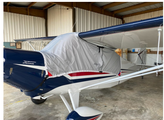
Aeronca Champ Travel Weight Canopy Cover