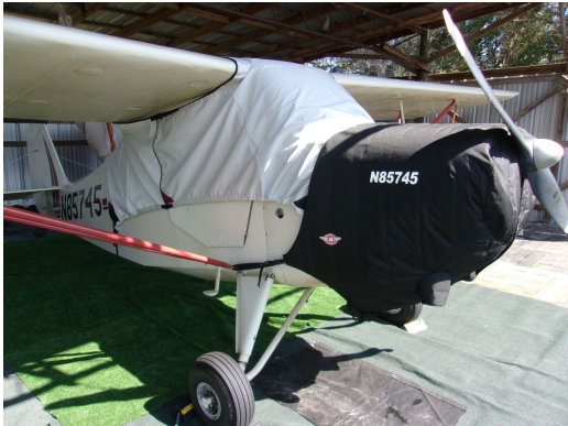
Aeronca 7AC Insulated Engine Cover, Canopy Cover

This cover type is made from Silver Acrylic Sunbrella canvas and is 100% lined with a soft and smooth microfiber. Bruce's Custom Covers developed this material combination especially for aircraft protection. The outer material is medium weight and treated for water resistance, UV resistance and anti-static buildup. The inner lining is a very soft and smooth microfiber to prevent scratching. The material is very reflective, and tests show that the cabin interior temperature can be reduced to near-ambient temperature on the hottest of days. It is water, ice and snow repellent, yet breathable to allow moisture to escape from between the cover and the aircraft surface.