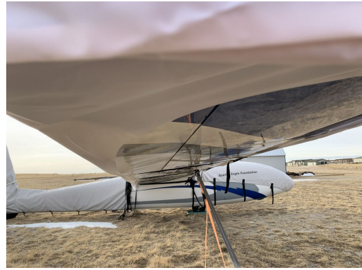
Blanik L-13 Canopy/Nose & Empennage Covers