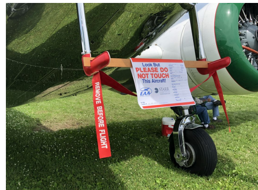
Lockheed 12 Pitot Covers