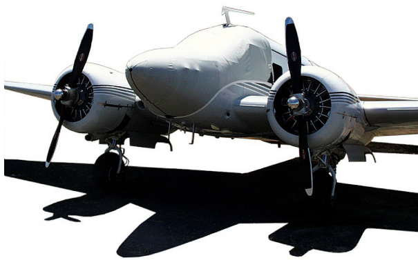
Beech 18 Cockpit/Nose Cover

This cover type is made from Silver Acrylic Sunbrella canvas and is 100% lined with a soft and smooth microfiber. Bruce's Custom Covers developed this material combination especially for aircraft protection. The outer material is medium weight and treated for water resistance, UV resistance and anti-static buildup. The inner lining is a very soft and smooth microfiber to prevent scratching. The material is very reflective, and tests show that the cabin interior temperature can be reduced to near-ambient temperature on the hottest of days. It is water, ice and snow repellent, yet breathable to allow moisture to escape from between the cover and the aircraft surface.