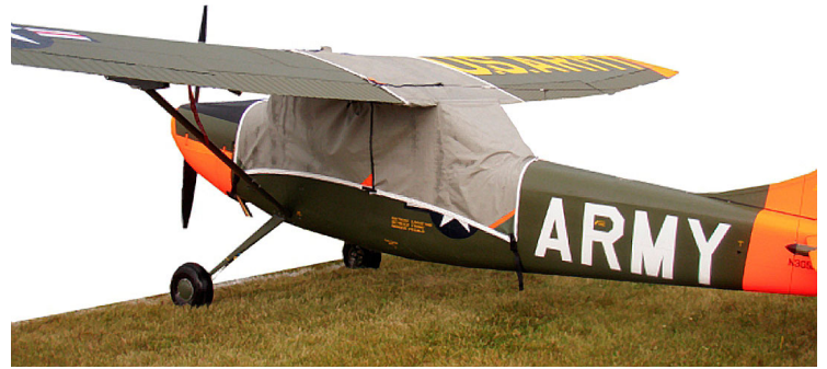
L-19 Canopy Cover