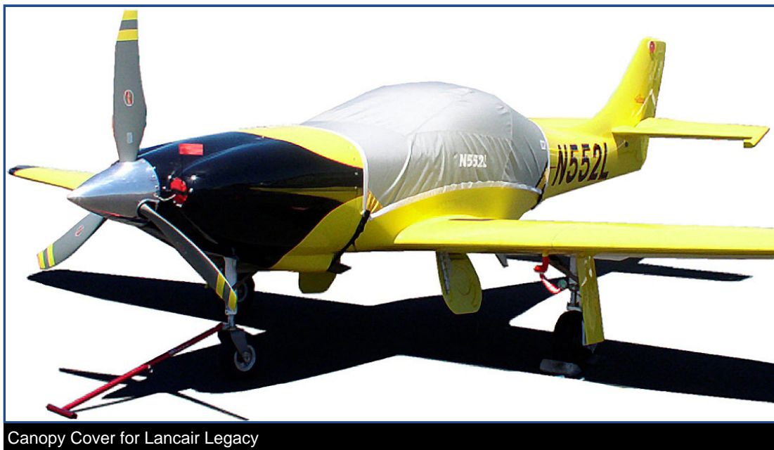
Canopy Cover for Lancair Legacy