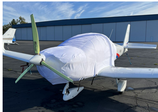
Jihlavan JA-600 Skyleader Extended Canopy/Engine Cover, test fit cover