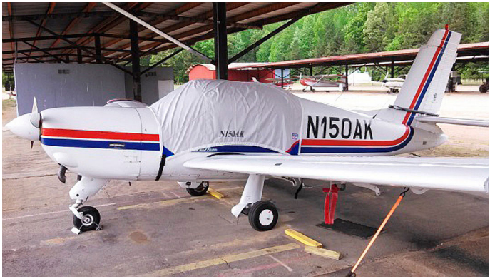
Rallye Canopy Cover