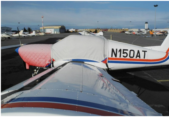
Koliber 150A Canopy Cover, Insulated Engine Cover