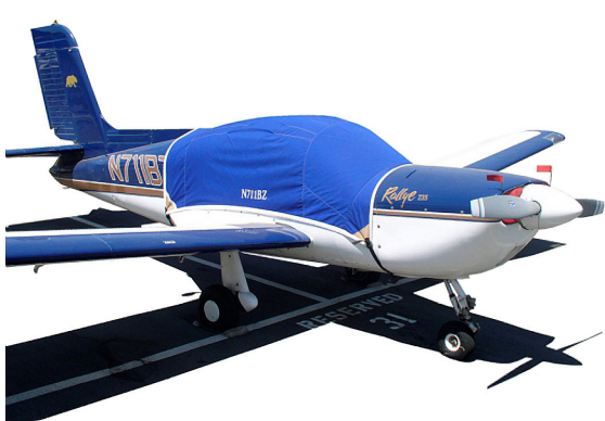
Rallye Canopy Cover