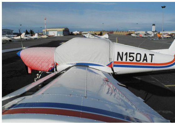
Koliber 150A Canopy Cover, Insulated Engine Cover