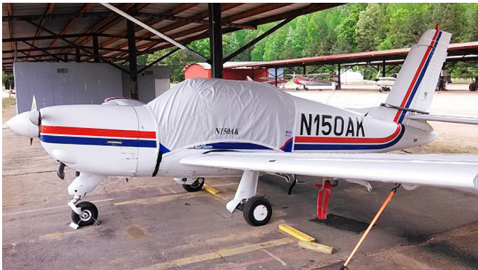
Rallye Canopy Cover

Travel Covers are made with Silver Solution-Dyed Polyester fabric and only lined over the windshield to save weight. The material is lightweight and more compact for easy stowage in the aircraft. The polyester material is water resistant, but only intended for occasional use outside. We also have an ultra lightweight material available for fitted hangar dust covers. For daily outdoor use, the non-travel Sunbrella Cover is the best choice.