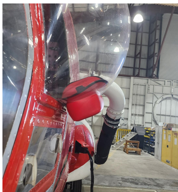
Boeing Vertol CH-47 Logger Window Plug

The Engine Inlet Plugs are custom fit for your Kaman KMAX intakes, made with heavy-duty vinyl material, and stuffed with a single block of sculpted urethane foam. Each plug has a zipper that allows the foam to be removed and dried if necessary. Engine plugs have 'Remove Before Flight' streamers sewn onto the face of the plugs. Most plugs are imprinted with the aircraft registration number in black for an extra charge. Storage bag NOT included. Engine plugs may be inserted after flight when the engine is still warm. Engine Inlet Plugs are commonly referred to as Cowl Plugs, Intake Plugs, Cowl Blocks, Engine Blocks, and Engine Bungs.