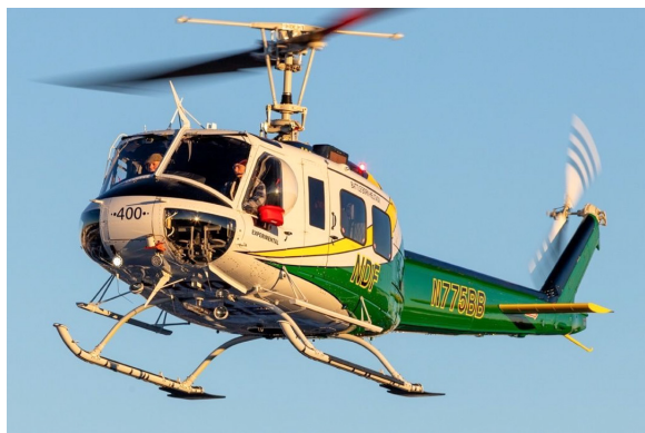
Bell 205 Logger Window Plug

The Engine Inlet Plugs are custom fit for your Kaman KMAX intakes, made with heavy-duty vinyl material, and stuffed with a single block of sculpted urethane foam. Each plug has a zipper that allows the foam to be removed and dried if necessary. Engine plugs have 'Remove Before Flight' streamers sewn onto the face of the plugs. Most plugs are imprinted with the aircraft registration number in black for an extra charge. Storage bag NOT included. Engine plugs may be inserted after flight when the engine is still warm. Engine Inlet Plugs are commonly referred to as Cowl Plugs, Intake Plugs, Cowl Blocks, Engine Blocks, and Engine Bungs.