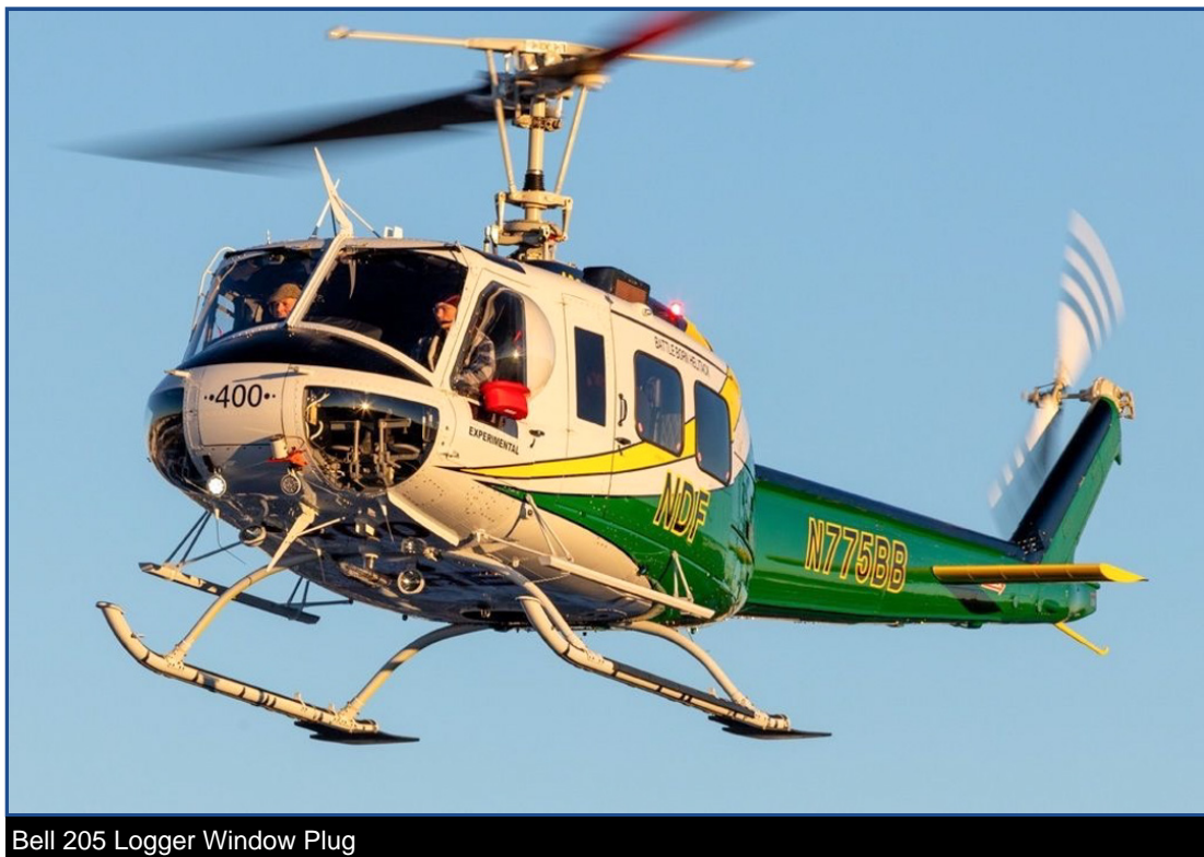
Bell 205 Logger Window Plug