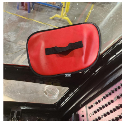
Boeing Vertol CH-47 Logger Window Plug