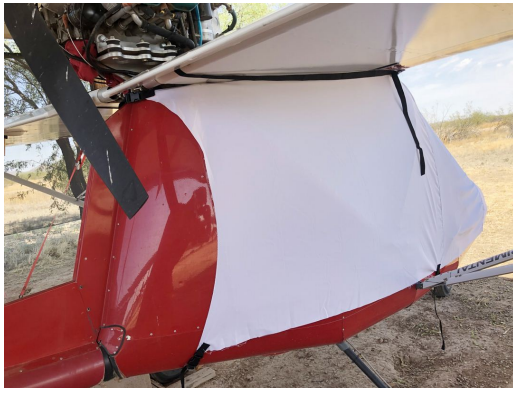
Rans S-12 Airaile Canopy/Nose Cover (test fit cover)