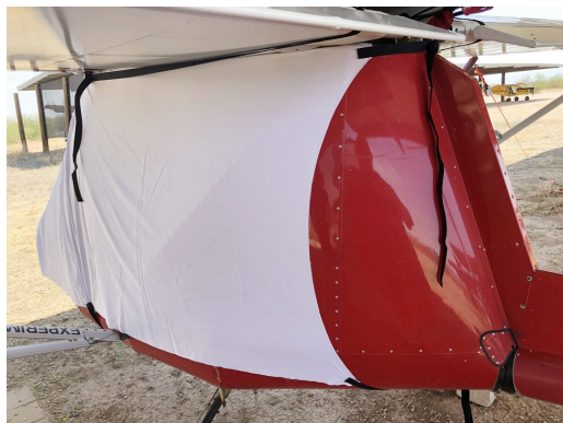
Rans S-12 Airaille Canopy/Nose Cover (test fit cover)

Travel Covers are made with Silver Solution-Dyed Polyester fabric and only lined over the windshield to save weight. The material is lightweight and more compact for easy stowage in the aircraft. The polyester material is water resistant, but only intended for occasional use outside. We also have an ultra lightweight material available for fitted hangar dust covers. For daily outdoor use, the non-travel Sunbrella Cover is the best choice.