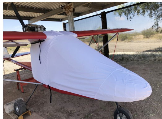
Rans S-12 Airaille Canopy/Nose Cover (test fit cover)