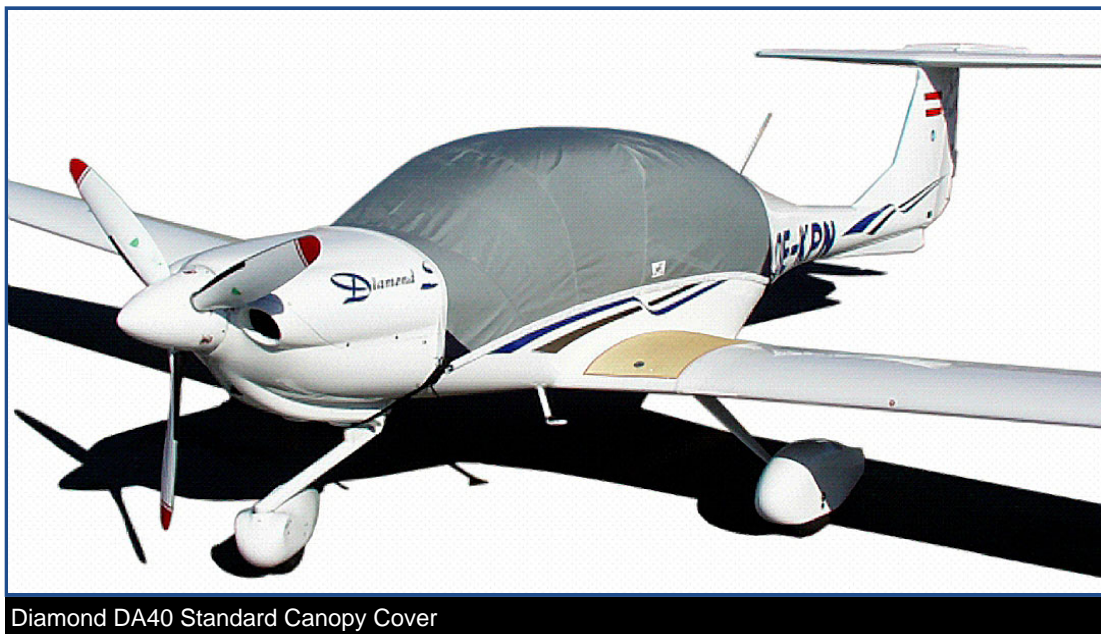
Diamond DA40 Standard Canopy Cover