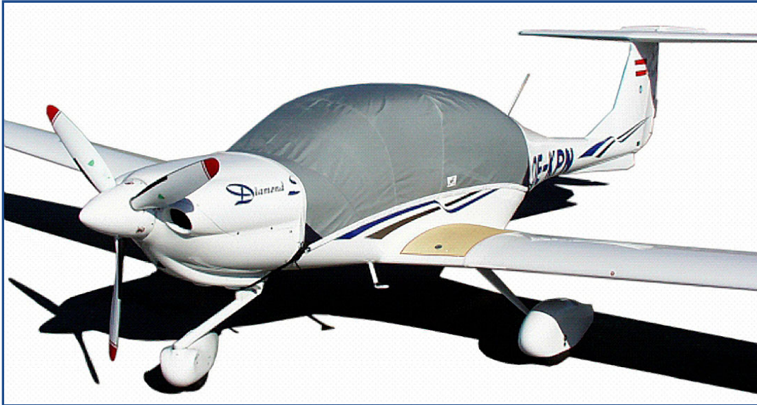
Diamond DA40 Standard Canopy Cover