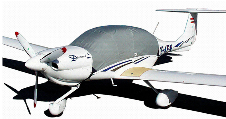
Diamond DA40 Standard Canopy Cover

very reflective, and tests show that the cabin interior temperature can be reduced to near-ambient temperature on the hottest of days. It is water, ice and snow repellent, yet breathable to allow moisture to escape from between the cover and the aircraft surface.