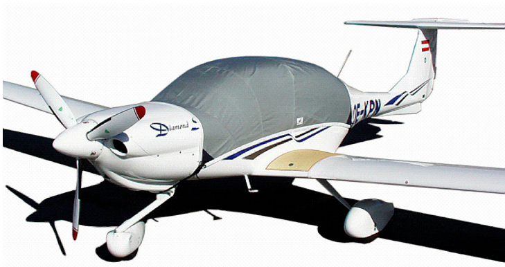
Diamond DA40 Standard Canopy Cover

reflective, and tests show that the cabin interior temperature can be reduced to near-ambient temperature on the hottest of days. It is water, ice and snow repellent, yet breathable to allow moisture to escape from between the cover and the aircraft surface.