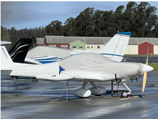
KIS 2-Place Canopy/Engine Cover