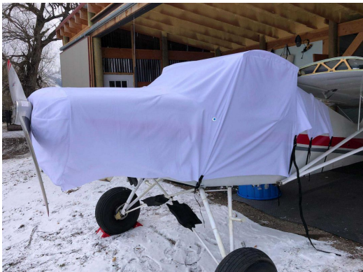
Kitfox Trailerable Canopy/Engine Cover, test fit cover