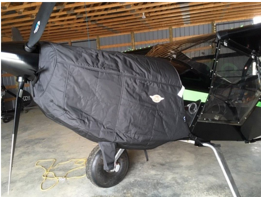
Kitfox V Insulated Engine Cover