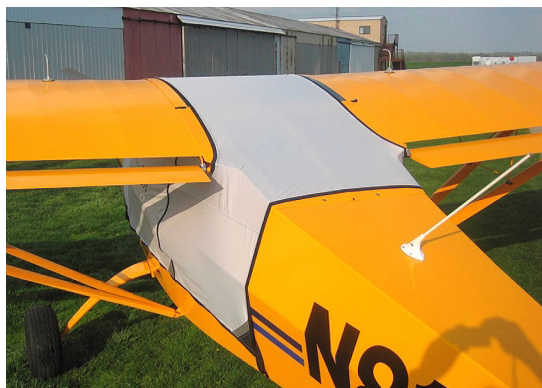
Aerotrek A240 Spandex FlyAway Travel Canopy Cover

Travel Covers are made with Silver Solution-Dyed Polyester fabric and only lined over the windshield to save weight. The material is lightweight and more compact for easy stowage in the aircraft. The polyester material is water resistant, but only intended for occasional use outside. We also have an ultra lightweight material available for fitted hangar dust covers. For daily outdoor use, the non-travel Sunbrella Cover is the best choice.