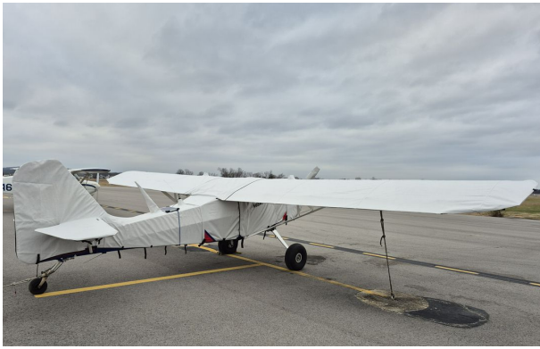
Kitfox V Complete Cover Set