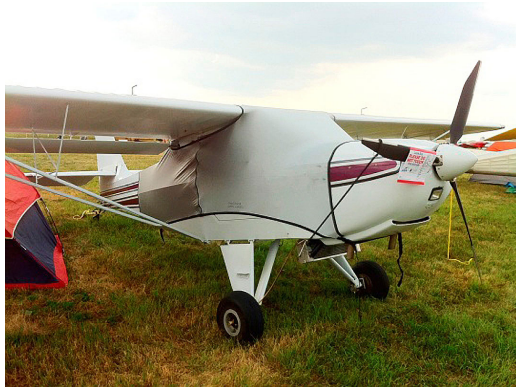
Kitfox Spandex FlyAway Travel Canopy Cover

Travel Covers are made with Silver Solution-Dyed Polyester fabric and only lined over the windshield to save weight. The material is lightweight and more compact for easy stowage in the aircraft. The polyester material is water resistant, but only intended for occasional use outside. We also have an ultra lightweight material available for fitted hangar dust covers. For daily outdoor use, the non-travel Sunbrella Cover is the best choice.