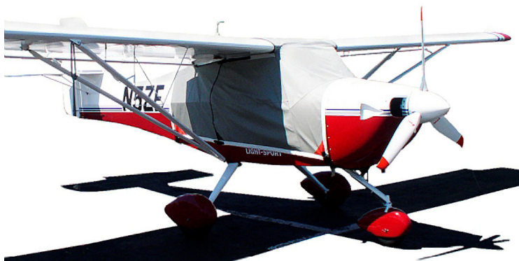
Aerotrek A240 Standard Canopy Cover