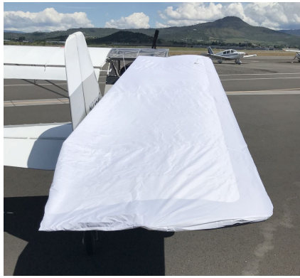
Kitfox Wing Covers, Folded Wing Type, test fit cover