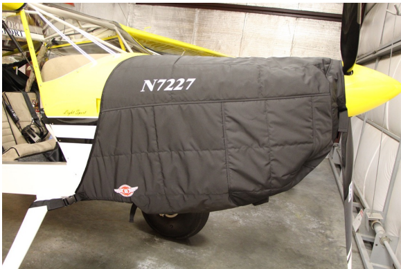
Kitfox Insulated Engine Cover