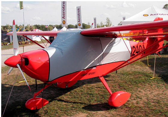
Aerotrek A240 Spandex FlyAway Travel Canopy Cover

This cover type is made from Silver Acrylic Sunbrella canvas and is 100% lined with a soft and smooth microfiber. Bruce's Custom Covers developed this material combination especially for aircraft protection. The outer material is medium weight and treated for water resistance, UV resistance and anti-static buildup. The inner lining is a very soft and smooth microfiber to prevent scratching. The material is very reflective, and tests show that the cabin interior temperature can be reduced to near-ambient temperature on the hottest of days. It is water, ice and snow repellent, yet breathable to allow moisture to escape from between the cover and the aircraft surface.