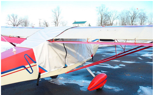
Kitfox IV Over-the-top Canopy Cover