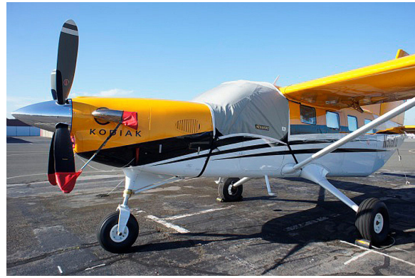
Quest Kodiak Cockpit Cover, Engine Plugs, Prop Tie/Exhaust Covers, & Cabin HeatShields set