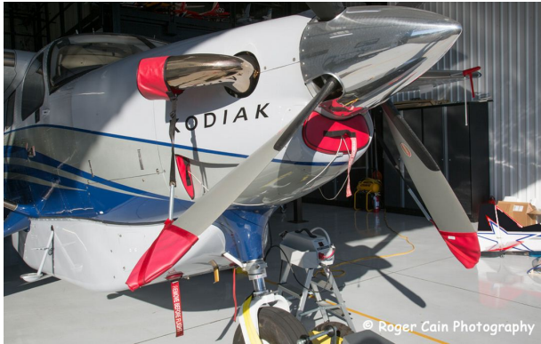
Quest Kodiak Engine Plugs, Prop Tie-Down & Exhaust Covers

water resistance, UV resistance and anti-static buildup. The inner lining is a very soft and smooth microfiber to prevent scratching. The material is very reflective, and tests show that the cabin interior temperature can be reduced to near-ambient temperature on the hottest of days. It is water, ice and snow repellent, yet breathable to allow moisture to escape from between the cover and the aircraft surface.