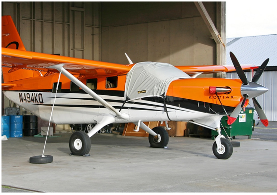
Quest Kodiak Windshield Cover, Prop Tie/Exhaust Covers, Engine Inlet Plugs & Pitot Cover