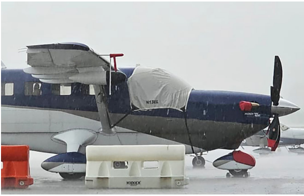
Quest Aircraft Kodiak Cockpit Cover