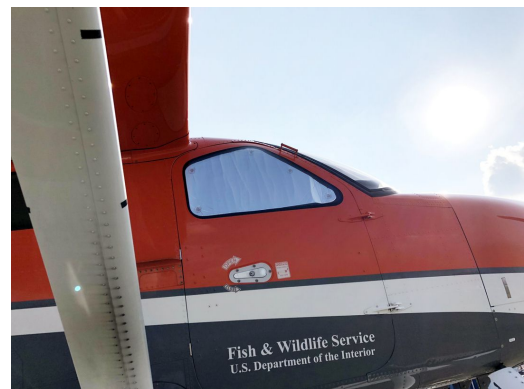
Quest Kodiak Cockpit HeatShields