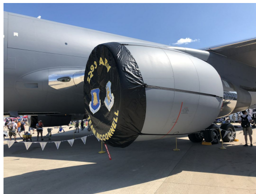
Boeing KC-46 Intake Cover