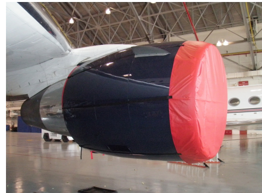
Boeing 767 Intake Covers Ship Set