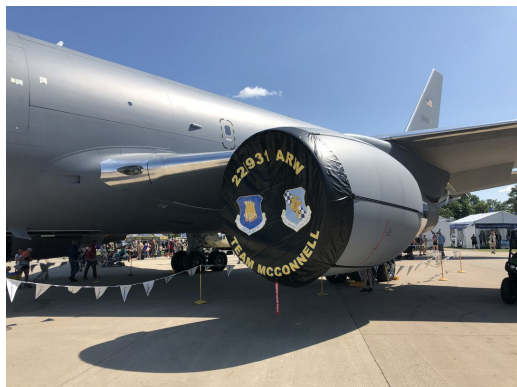
Boeing KC-46 Intake Cover