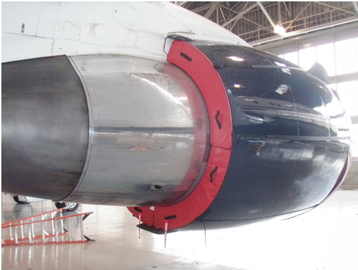
Boeing 767 Exhaust Plugs Ship Set, incl. Fan Thrust Reverser and Exhaust Plugs P/N: B767-200

The Engine Inlet Plugs are custom fit for your Boeing KC-46, KC-46A, Pegasus intakes, made with heavy-duty vinyl material, and stuffed with a single block of sculpted urethane foam. Each plug has a zipper that allows the foam to be removed and dried if necessary. Engine plugs have 'remove before flight' streamers sewn onto the face of the plugs. Most plugs are imprinted with the aircraft registration number in black for an extra charge. Storage bag NOT included. Engine plugs may be inserted after flight when the engine is still warm. Engine Inlet Plugs are commonly referred to as Cowl Plugs, Intake Plugs, Cowl Blocks, Engine Blocks, and Engine Bungs.