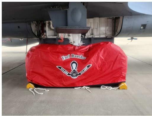
Boeing KC-135 Main Gear Tire Covers