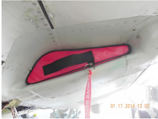
KC-135 ACM Inlet Plug

The Engine Inlet Plugs are custom fit for your Boeing KC-135, C-135, RC-135, EC-135 intakes, made with heavy-duty vinyl material, and stuffed with a single block of sculpted urethane foam. Each plug has a zipper that allows the foam to be removed and dried if necessary. Engine plugs have 'remove before flight' streamers sewn onto the face of the plugs. Most plugs are imprinted with the aircraft registration number in black for an extra charge. Storage bag NOT included. Engine plugs may be inserted after flight when the engine is still warm. Engine Inlet Plugs are commonly referred to as Cowl Plugs, Intake Plugs, Cowl Blocks, Engine Blocks, and Engine Bungs.