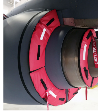
Boeing KC-135 Bypass Vent & Exhaust Plugs