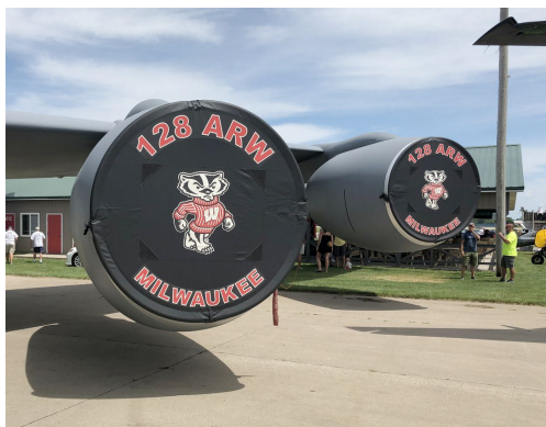
Boeing KC-135 Intake Covers, Tamborine Type

The Boeing KC-135, C-135, RC-135, EC-135 Intake Covers are designed to install easily yet be completely storable. A spring steel hoop is sewn into the hem of each cover, allowing them to be installed without climbing onto the wing or using a stepladder. To store the covers the spring steel hoop folds like a band-saw blade into three nesting rings. Each cover folds into a compact circular bundle which is stored in the included duffle bag, yet they unfold quickly for use. The Tri-Fold Ring cover is made of medium weight nylon which is available in a variety of colors to match the paint trim. Each cover set comes complete with installation and folding instructions. The aircraft's registration number can be silkscreened onto the cover for an extra charge.