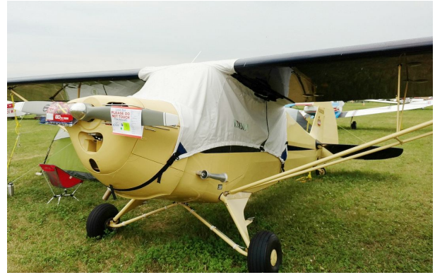
Piper J-4 Cub Coupe Canopy Cover (Over-Top)