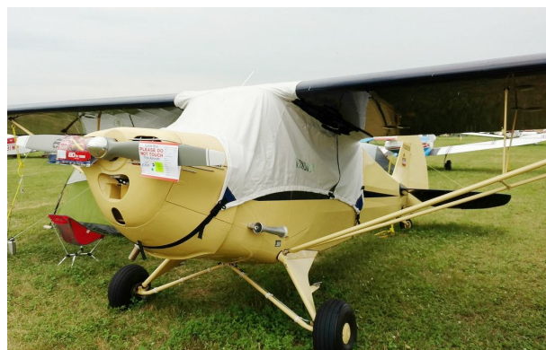
Piper J-4 Cub Coupe Canopy Cover (Over-Top)