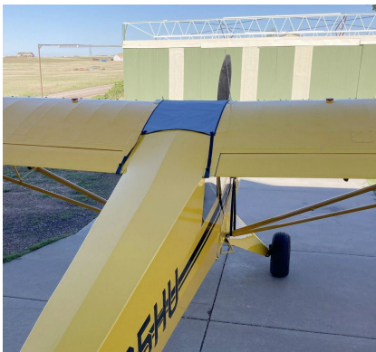
Aviat Husky Windshield/Skylight Cover

This cover type is made from Silver Acrylic Sunbrella canvas and is 100% lined with a soft and smooth microfiber. Bruce's Custom Covers developed this material combination especially for aircraft protection. The outer material is medium weight and treated for water resistance, UV resistance and anti-static buildup. The inner lining is a very soft and smooth microfiber to prevent scratching. The material is very reflective, and tests show that the cabin interior temperature can be reduced to near-ambient temperature on the hottest of days. It is water, ice and snow repellent, yet breathable to allow moisture to escape from between the cover and the aircraft surface.