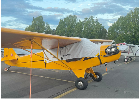
Piper J3 Canopy Cover, Prop Cover