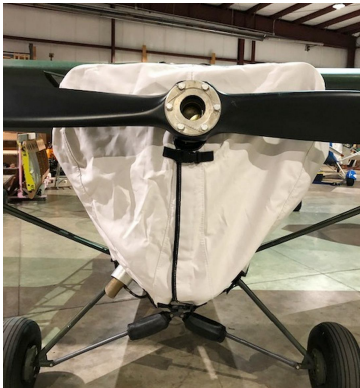
Piper J3C-65 Engine Cover