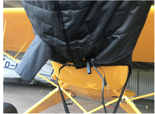
Legend Cub AL3 Insulated Engine Cover