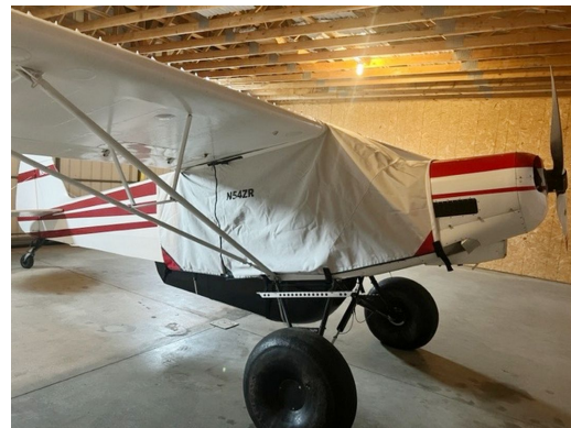
Piper PA-11 Extended Canopy Cover, Over the Top Style