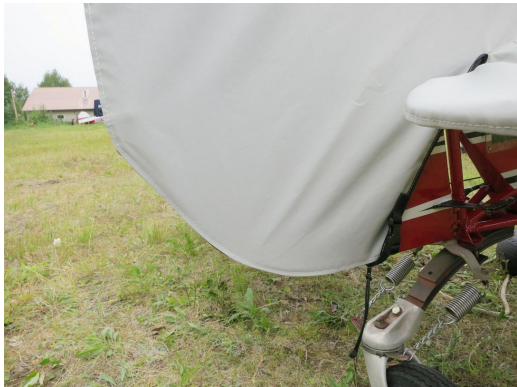
Piper PA-12 Abbreviated Empennage Cover

WINTER USE MATERIAL - Made with Solution-Dyed Polyester fabric, this option is intended for seasonal use to aid in deicing, rain mitigation, or for occasional travel. The material is lighter and more compact, but more susceptible to UV damage and may have a shorter useful life if used continuously outside than the all-year use material.