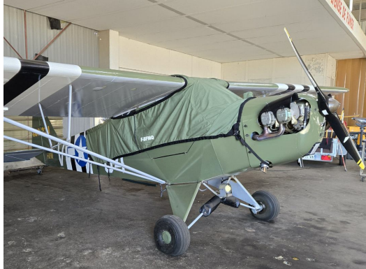
Piper L-4 Travel Canopy Cover, over-top type

This cover type is made from Silver Acrylic Sunbrella canvas and is 100% lined with a soft and smooth microfiber. Bruce's Custom Covers developed this material combination especially for aircraft protection. The outer material is medium weight and treated for water resistance, UV resistance and anti-static buildup. The inner lining is a very soft and smooth microfiber to prevent scratching. The material is very reflective, and tests show that the cabin interior temperature can be reduced to near-ambient temperature on the hottest of days. It is water, ice and snow repellent, yet breathable to allow moisture to escape from between the cover and the aircraft surface.