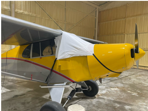
Piper J5A Windshield/Skylight Cover, test fit

This cover type is made from Silver Acrylic Sunbrella canvas and is 100% lined with a soft and smooth microfiber. Bruce's Custom Covers developed this material combination especially for aircraft protection. The outer material is medium weight and treated for water resistance, UV resistance and anti-static buildup. The inner lining is a very soft and smooth microfiber to prevent scratching. The material is very reflective, and tests show that the cabin interior temperature can be reduced to near-ambient temperature on the hottest of days. It is water, ice and snow repellent, yet breathable to allow moisture to escape from between the cover and the aircraft surface.