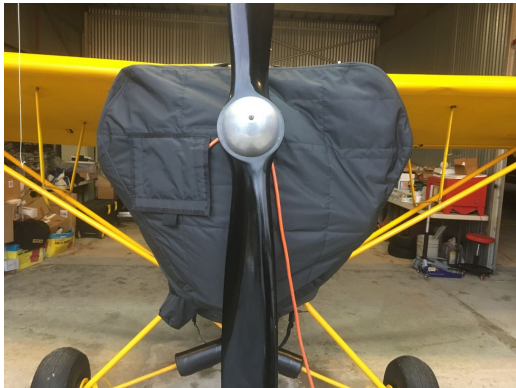
Piper J3 Cub Insulated Engine Cover