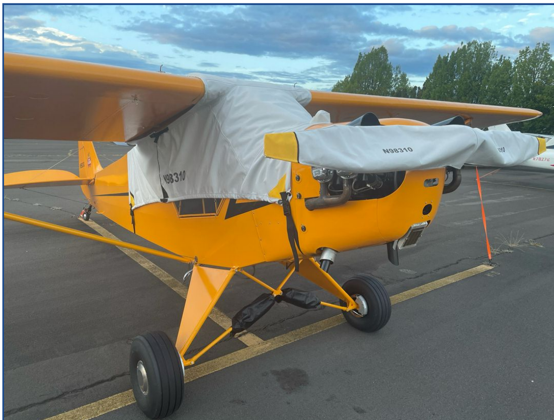
Piper J3 Canopy Cover, Prop Cover