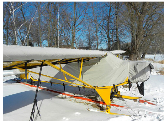
Piper J3 Cub Full Cover Set