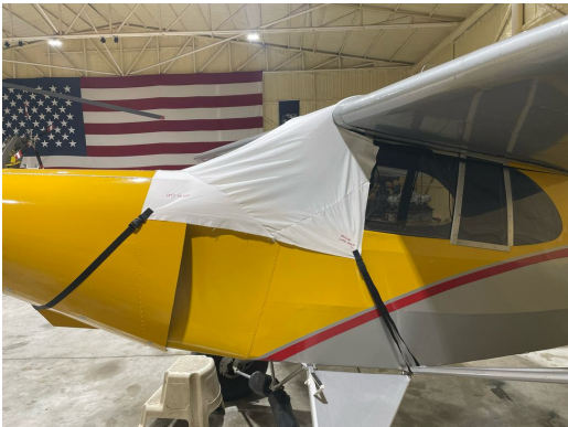
Piper J5A Windshield/Skylight Cover, test fit