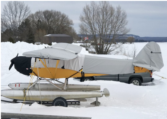
Piper J3 Cub Extended Canopy, Wings, Empennage & Insulated Engine Covers

WINTER USE MATERIAL - Made with Solution-Dyed Polyester fabric, this option is intended for seasonal use to aid in deicing, rain mitigation, or for occasional travel. The material is lighter and more compact, but more susceptible to UV damage and may have a shorter useful life if used continuously outside than the all-year use material.