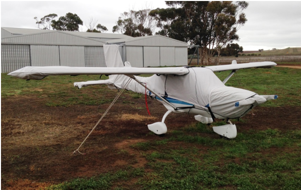
FOR INTERIOR USE. Cub Crafters CC-11 Insulated Hangar Blanket, available in Red or Silver Jabiru 160 Canopy, Engine, Prop, Wings & Empennage Covers