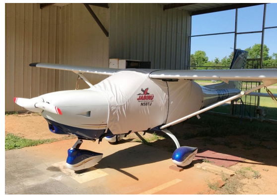
Jabiru J250-SP Canopy Cover