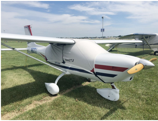
Jabiru J250 Canopy Cover