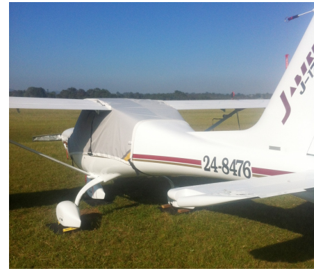
Jabiru 170 Canopy Cover