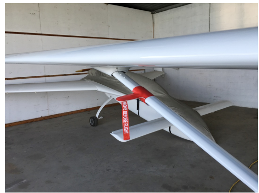
Jabiru Pitot Cover