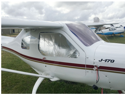
Jabiru 170 Heatshield Set