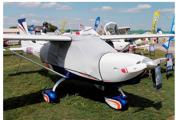
Jabiru Spandex FlyAway Travel Canopy Cover