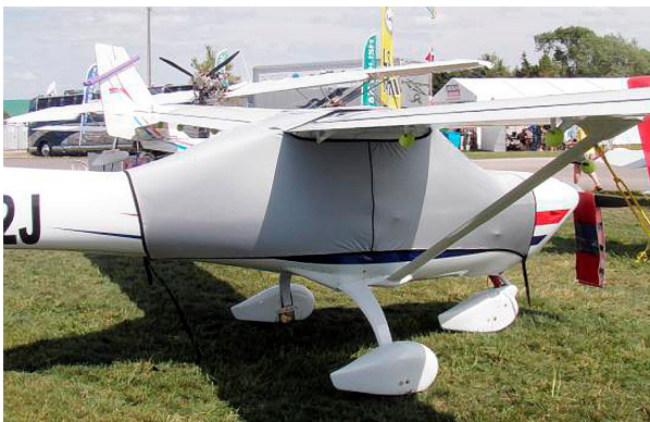
Jabiru Spandex FlyAway Travel Canopy Cover

Travel Covers are made with Silver Solution-Dyed Polyester fabric and only lined over the windshield to save weight. The material is lightweight and more compact for easy stowage in the aircraft. The polyester material is water resistant, but only intended for occasional use outside. We also have an ultra lightweight material available for fitted hangar dust covers. For daily outdoor use, the non-travel Sunbrella Cover is the best choice.