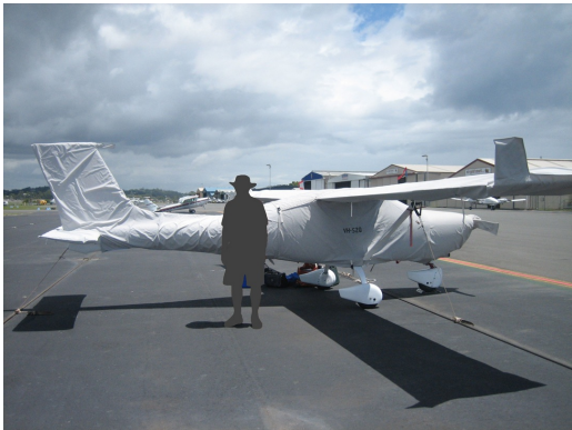
Jabiru J430 Complete Cover Set

WINTER USE MATERIAL - Made with Solution-Dyed Polyester fabric, this option is intended for seasonal use to aid in deicing, rain mitigation, or for occasional travel. The material is lighter and more compact, but more susceptible to UV damage and may have a shorter useful life if used continuously outside than the all-year use material.