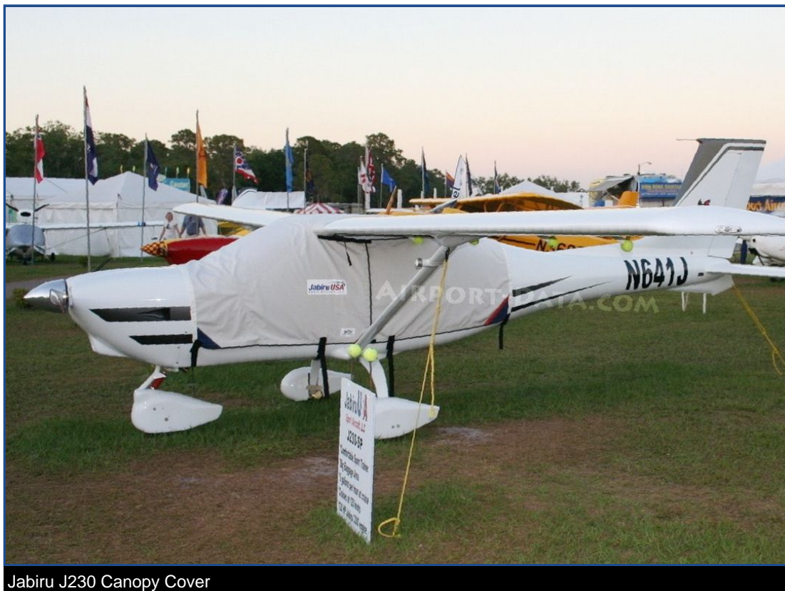
Jabiru J230 Canopy Cover