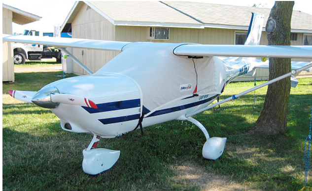
Jabiru 250 Standard Canopy Cover

This cover type is made from Silver Acrylic Sunbrella canvas and is 100% lined with a soft and smooth microfiber. Bruce's Custom Covers developed this material combination especially for aircraft protection. The outer material is medium weight and treated for water resistance, UV resistance and anti-static buildup. The inner lining is a very soft and smooth microfiber to prevent scratching. The material is very reflective, and tests show that the cabin interior temperature can be reduced to near-ambient temperature on the hottest of days. It is water, ice and snow repellent, yet breathable to allow moisture to escape from between the cover and the aircraft surface.