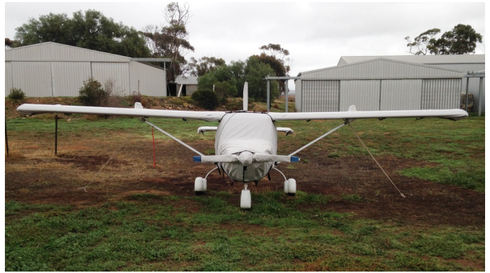
Jabiru 160 Canopy, Engine, Prop, Wings & Empennage Covers Jabiru 160 Canopy, Engine, Prop, Wings & Empennage Covers