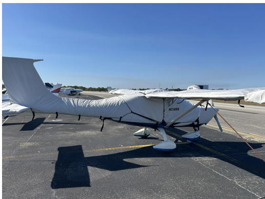
Jabiru 230D Complete Cover Set

This cover type is made from Silver Acrylic Sunbrella canvas and is 100% lined with a soft and smooth microfiber. Bruce's Custom Covers developed this material combination especially for aircraft protection. The outer material is medium weight and treated for water resistance, UV resistance and anti-static buildup. The inner lining is a very soft and smooth microfiber to prevent scratching. The material is very reflective, and tests show that the cabin interior temperature can be reduced to near-ambient temperature on the hottest of days. It is water, ice and snow repellent, yet breathable to allow moisture to escape from between the cover and the aircraft surface.