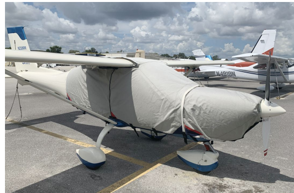
Jabiru 230D Extended Canopy Cover & Engine Covers