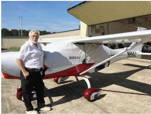
Jabiru 230SP Canopy Cover, Over-Top Style

This cover type is made from Silver Acrylic Sunbrella canvas and is 100% lined with a soft and smooth microfiber. Bruce's Custom Covers developed this material combination especially for aircraft protection. The outer material is medium weight and treated for water resistance, UV resistance and anti-static buildup. The inner lining is a very soft and smooth microfiber to prevent scratching. The material is very reflective, and tests show that the cabin interior temperature can be reduced to near-ambient temperature on the hottest of days. It is water, ice and snow repellent, yet breathable to allow moisture to escape from between the cover and the aircraft surface.