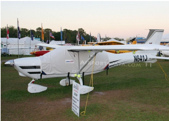
Jabiru J230 Canopy Cover

This cover type is made from Silver Acrylic Sunbrella canvas and is 100% lined with a soft and smooth microfiber. Bruce's Custom Covers developed this material combination especially for aircraft protection. The outer material is medium weight and treated for water resistance, UV resistance and anti-static buildup. The inner lining is a very soft and smooth microfiber to prevent scratching. The material is very reflective, and tests show that the cabin interior temperature can be reduced to near-ambient temperature on the hottest of days. It is water, ice and snow repellent, yet breathable to allow moisture to escape from between the cover and the aircraft surface.