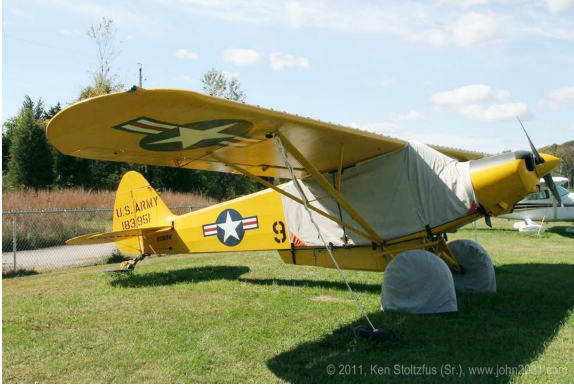
Piper L-21b Extended Canopy Cover, Tire Covers

The Interstate, Arctic Tern All Models (and similar) Tailcone Cover fits onto the tailcone area to cover the holes that birds can fly into and nest. The cover easily straps onto the leading edge of the horizontal stabilizer with padded hooks or overlaps with the elevators slightly and attaches under the horizontal stabilizers with adjustable straps. Tailcone Covers are normally made with Solution-Dyed Polyester or Acrylic Sunbrella .