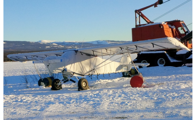
Piper Super Cub Complete Cover Set