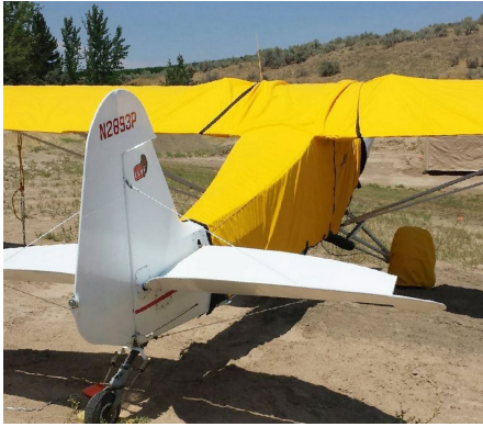
Piper PA-18 Super Cub Extended Canopy Cover, Wing &amp; Tire Covers

The Interstate, Arctic Tern All Models (and similar) Tailcone Cover fits onto the tailcone area to cover the holes that birds can fly into and nest. The cover easily straps onto the leading edge of the horizontal stabilizer with padded hooks or overlaps with the elevators slightly and attaches under the horizontal stabilizers with adjustable straps. Tailcone Covers are normally made with Solution-Dyed Polyester or Acrylic Sunbrella .