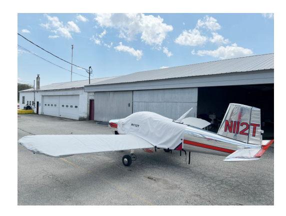
Thorp Sky Scooter Extended Canopy Cover & Wing Covers