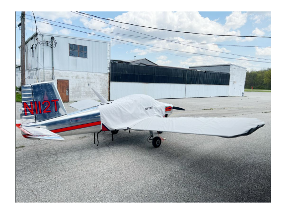
Thorp Sky Scooter Extended Canopy Cover & Wing Covers

This cover type is made from Silver Acrylic Sunbrella canvas and is 100% lined with a soft and smooth microfiber. Bruce's Custom Covers developed this material combination especially for aircraft protection. The outer material is medium weight and treated for water resistance, UV resistance and anti-static buildup. The inner lining is a very soft and smooth microfiber to prevent scratching. The material is very reflective, and tests show that the cabin interior temperature can be reduced to near-ambient temperature on the hottest of days. It is water, ice and snow repellent, yet breathable to allow moisture to escape from between the cover and the aircraft surface.