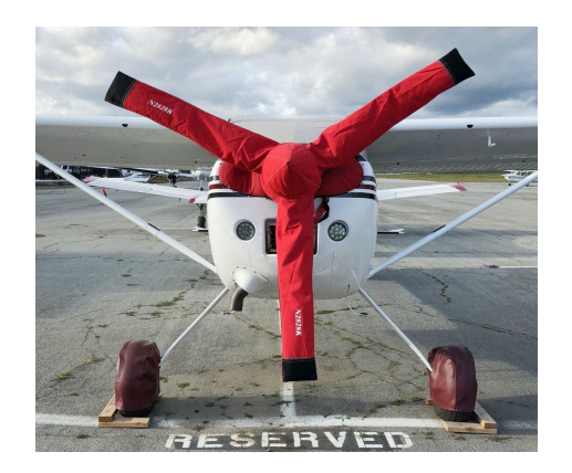
Cessna Skywagon Propellor/Spinner Cover, 3-blade type