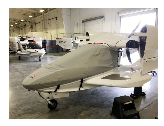
Icon A5 Travel Weight Canopy/Nose Cover, Engine Cover