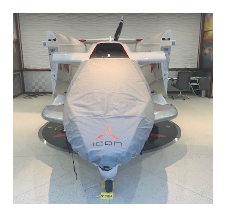
Icon A5 Canopy/Nose Cover