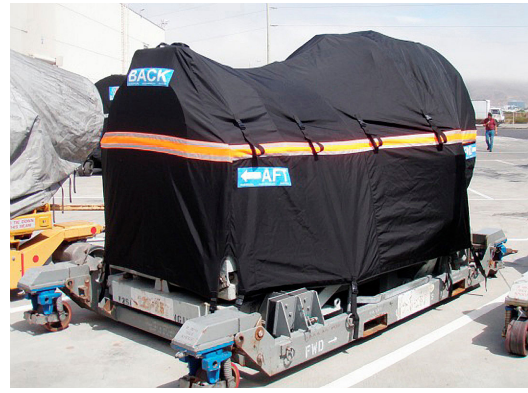
IAE V2500 QEC OFF-LINK JET ENGINE COVER, "rain cap" style