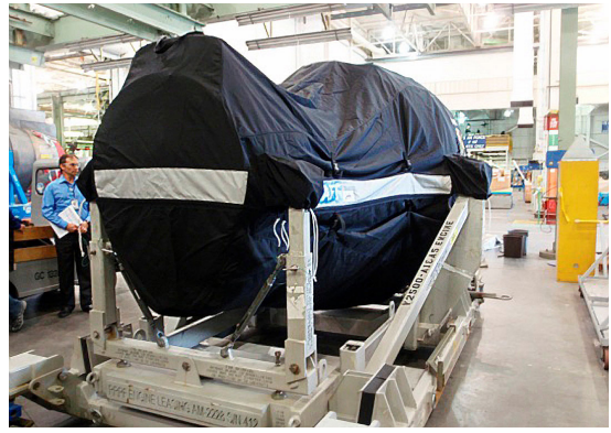
QEC OFF-LINK JET ENGINE COVER, V2500 Series, fully enclosed