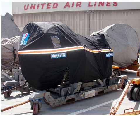
IAE V2500 QEC OFF-LINK JET ENGINE COVER, "rain cap" style