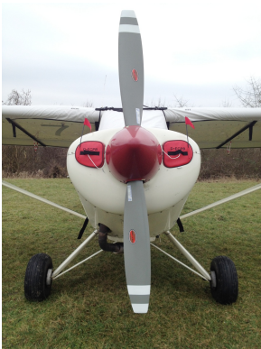
Aviat Husky Engine Plugs, Wing Covers