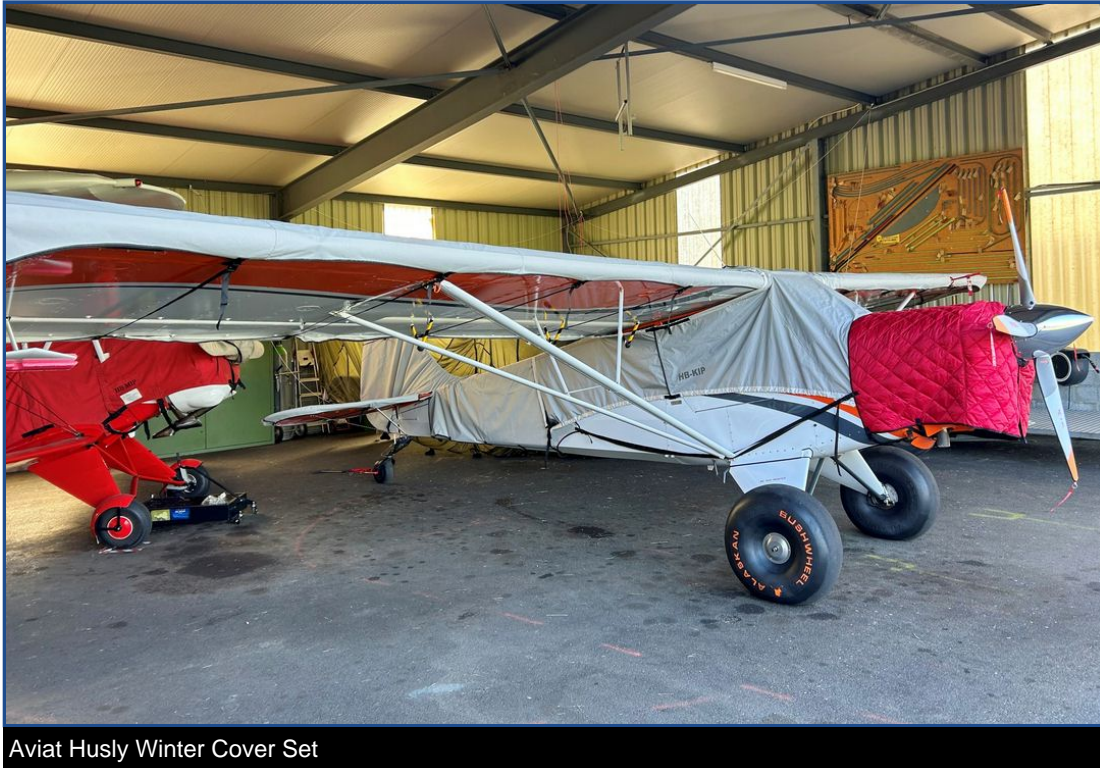
Aviat Husly Winter Cover Set