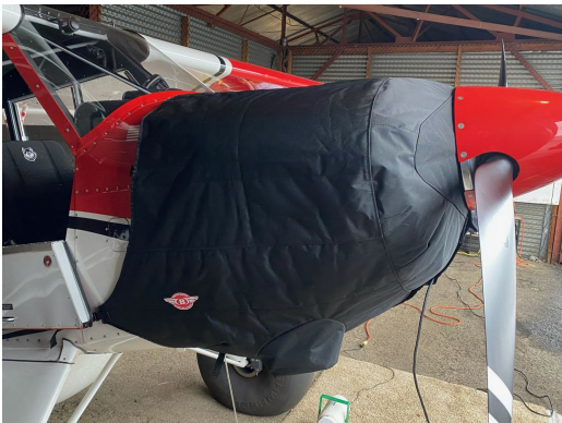
Aviat Husky insulated engine cover