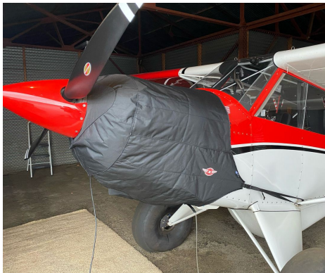
Aviat Husky Insulated Engine Cover

This cover type is made from Silver Acrylic Sunbrella canvas and is 100% lined with a soft and smooth microfiber. Bruce's Custom Covers developed this material combination especially for aircraft protection. The outer material is medium weight and treated for water resistance, UV resistance and anti-static buildup. The inner lining is a very soft and smooth microfiber to prevent scratching. The material is very reflective, and tests show that the cabin interior temperature can be reduced to near-ambient temperature on the hottest of days. It is water, ice and snow repellent, yet breathable to allow moisture to escape from between the cover and the aircraft surface.