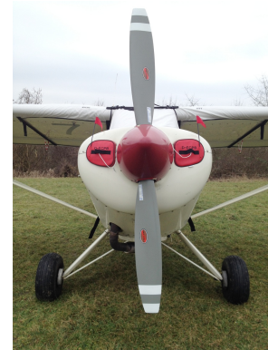
Aviat Husky Engine Plugs, Wing Covers