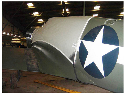
P40 Canopy Cover