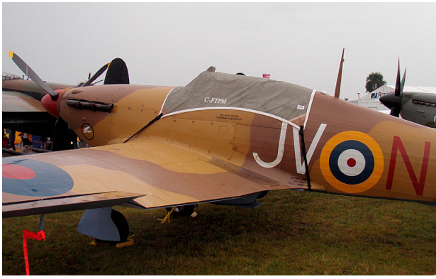
Hawker Hurricane Canopy Cover