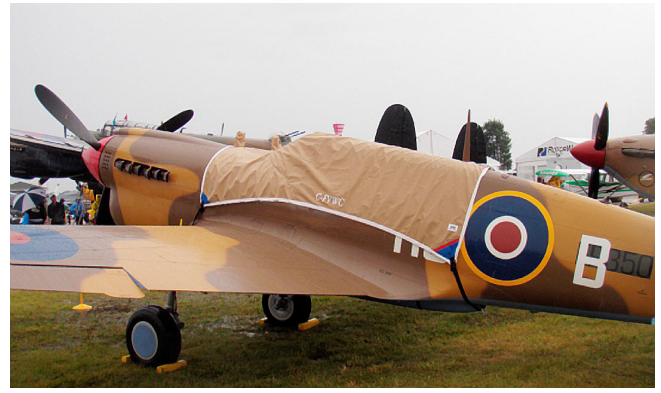
P40 Canopy Cover