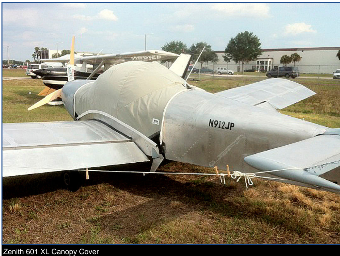
Zenith 601 XL Canopy Cover