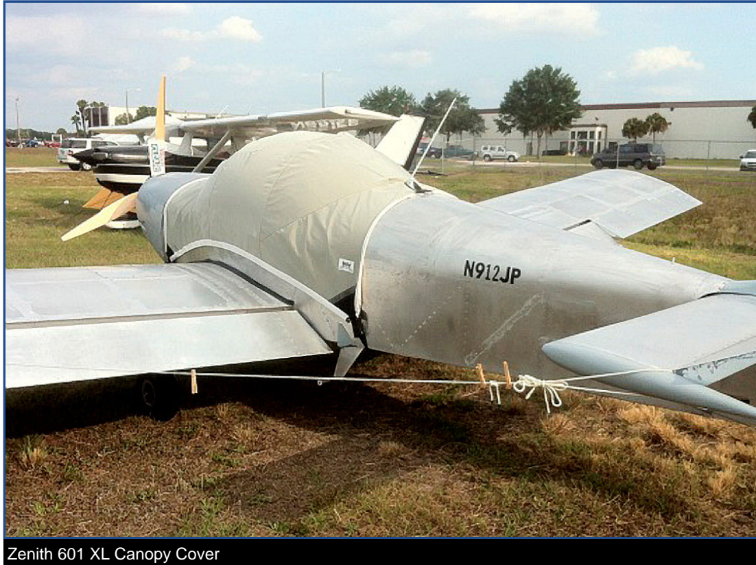
Zenith 601 XL Canopy Cover