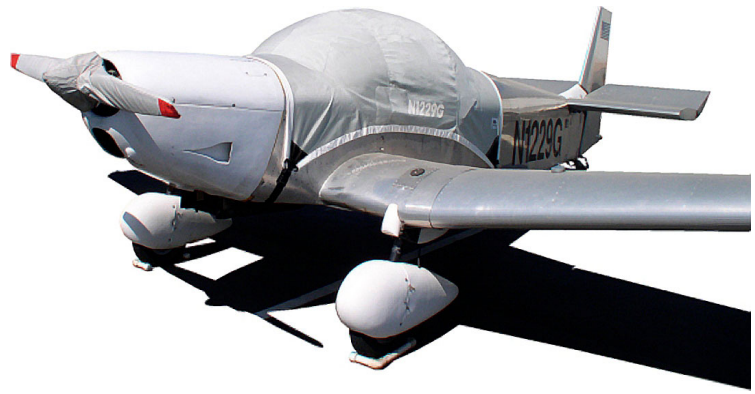
Zenith CH601 Canopy Cover & Prop Cover