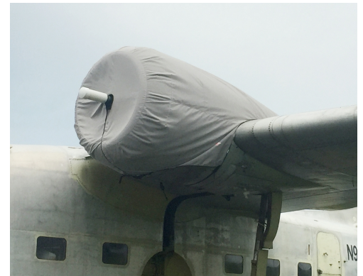
Grumman Albatross Engine Covers