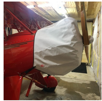
Hatz Biplane CB-1 Engine Cover