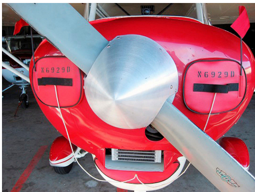
Piper PA-22-150 Engine Inlet Plugs (set of 3)

Engine Inlet Plugs are custom fit for your Hatz Biplane CB-1 intakes, made with heavy-duty vinyl material, and stuffed with a single block of sculpted urethane foam. Each plug has a zipper that allows the foam to be removed and dried if necessary. Engine plugs have warning flags that are visible from the cockpit or 'remove before flight' streamers sewn onto the face of the plugs. Most plugs are imprinted with the aircraft registration number in black for an extra charge. Storage bag NOT included. Engine plugs may be inserted after flight when the engine is still warm. Engine Inlet Plugs are commonly referred to as Cowl Plugs, Intake Plugs, Cowl Blocks, Engine Blocks, and Engine Bungs.