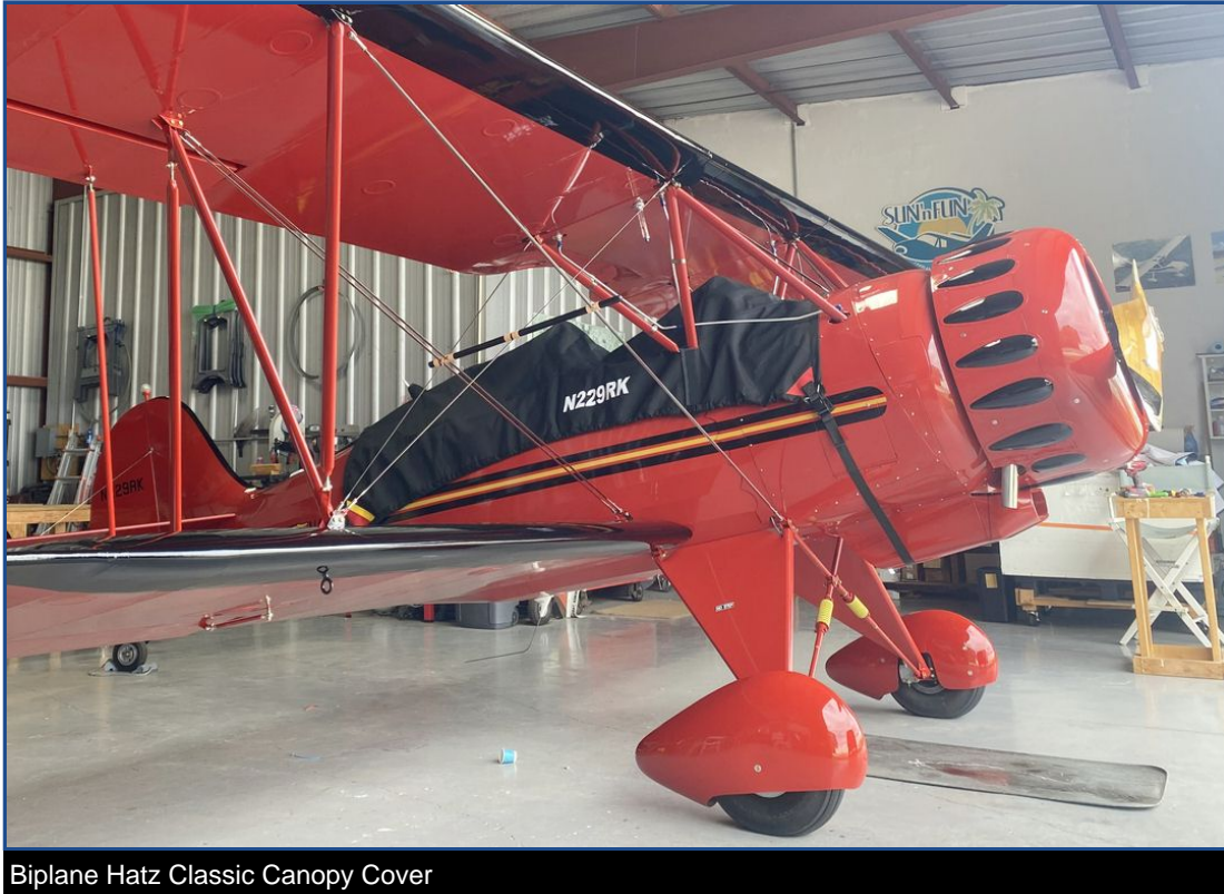
Biplane Hatz Classic Canopy Cover