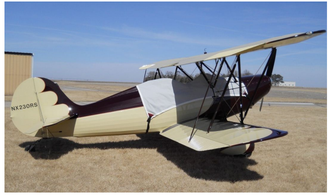
Hatz Biplane Canopy Cover