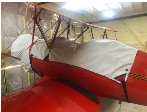
Hatz Biplane CB-1 Canopy Cover & Engine Cover