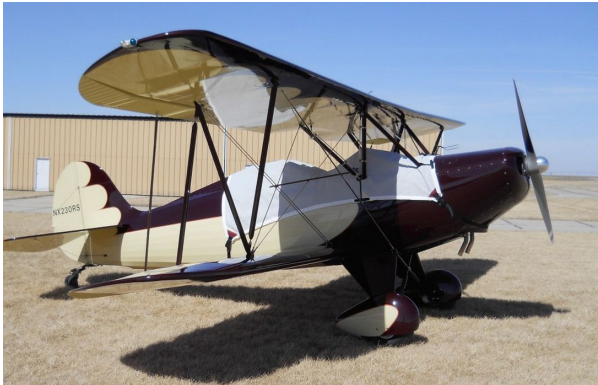
Hatz Biplane Canopy Cover