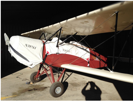
Hatz Biplane Canopy and Engine Covers