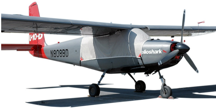
Helio Courier Canopy Cover & Engine Plugx