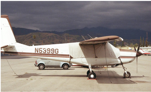
Helio Courier Canopy Cover, over top type

This cover type is made from Silver Acrylic Sunbrella canvas and is 100% lined with a soft and smooth microfiber. Bruce's Custom Covers developed this material combination especially for aircraft protection. The outer material is medium weight and treated for water resistance, UV resistance and anti-static buildup. The inner lining is a very soft and smooth microfiber to prevent scratching. The material is very reflective, and tests show that the cabin interior temperature can be reduced to near-ambient temperature on the hottest of days. It is water, ice and snow repellent, yet breathable to allow moisture to escape from between the cover and the aircraft surface.