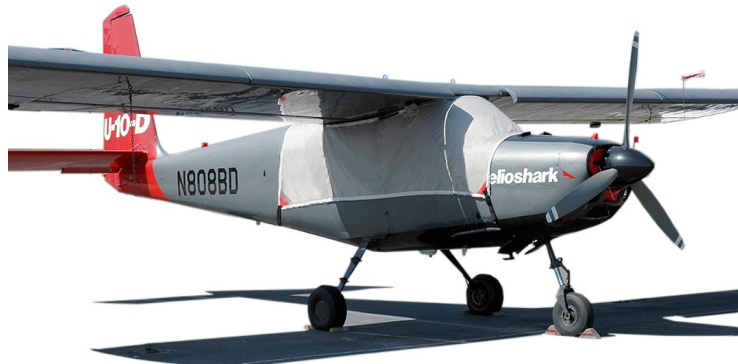
Helio Courier Canopy Cover & Engine Plugx

This cover type is made from Silver Acrylic Sunbrella canvas and is 100% lined with a soft and smooth microfiber. Bruce's Custom Covers developed this material combination especially for aircraft protection. The outer material is medium weight and treated for water resistance, UV resistance and anti-static buildup. The inner lining is a very soft and smooth microfiber to prevent scratching. The material is very reflective, and tests show that the cabin interior temperature can be reduced to near-ambient temperature on the hottest of days. It is water, ice and snow repellent, yet breathable to allow moisture to escape from between the cover and the aircraft surface.