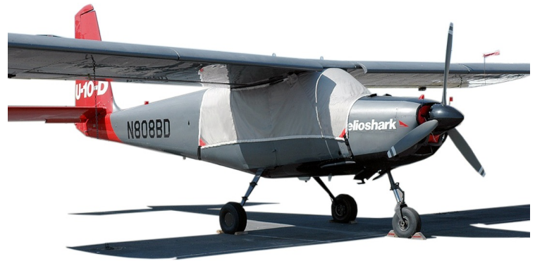
Helio Courier Canopy Cover & Engine Plugx