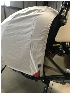
Helicycle Bubble Cover