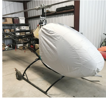
Helicycle Bubble Cover