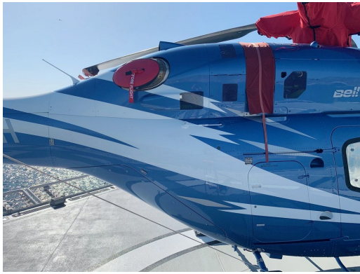
Bell 429 Exhaust Plug, Rotor Mast Cover