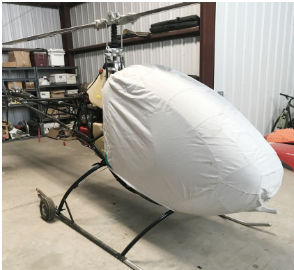
Helicycle Bubble Cover

This cover type is made from Silver Acrylic Sunbrella canvas and is 100% lined with a soft and smooth microfiber. Bruce's Custom Covers developed this material combination especially for aircraft protection. The outer material is medium weight and treated for water resistance, UV resistance and anti-static buildup. The inner lining is a very soft and smooth microfiber to prevent scratching. The material is very reflective, and tests show that the cabin interior temperature can be reduced to near-ambient temperature on the hottest of days. It is water, ice and snow repellent, yet breathable to allow moisture to escape from between the cover and the aircraft surface.