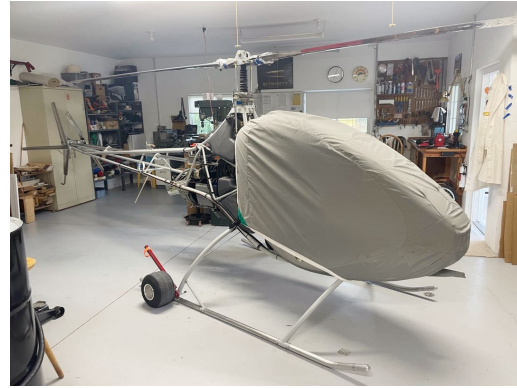
Eagle Helicycle Bubble Cover