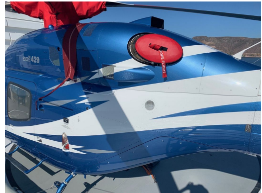
Bell 429 Exhaust Plug