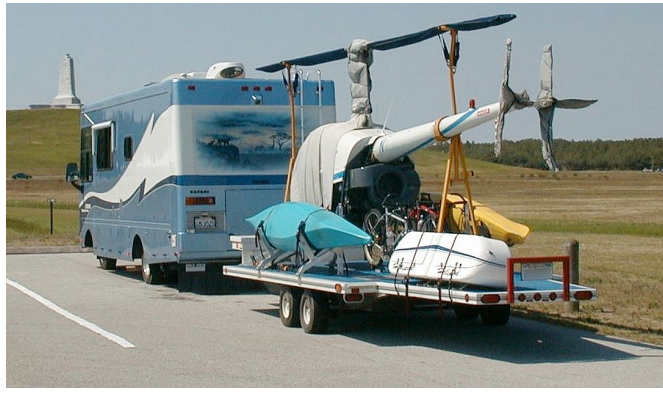
Robinson R-22 Bubble, Rotor Mast, Blades, Tail Rotor & Stabilizer Covers