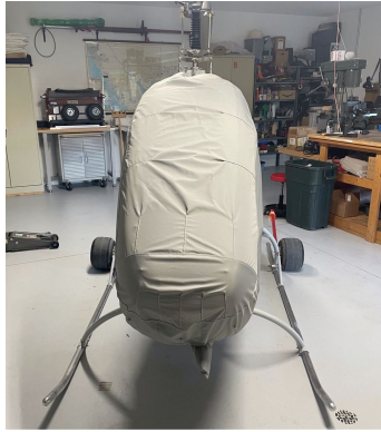
Eagle Helicycle Bubble Cover

This cover type is made from Silver Acrylic Sunbrella canvas and is 100% lined with a soft and smooth microfiber. Bruce's Custom Covers developed this material combination especially for aircraft protection. The outer material is medium weight and treated for water resistance, UV resistance and anti-static buildup. The inner lining is a very soft and smooth microfiber to prevent scratching. The material is very reflective, and tests show that the cabin interior temperature can be reduced to near-ambient temperature on the hottest of days. It is water, ice and snow repellent, yet breathable to allow moisture to escape from between the cover and the aircraft surface.