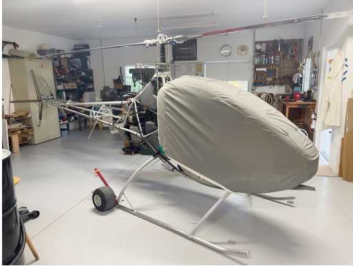
Eagle Helicycle Bubble Cover

and more compact for easy stowage in the aircraft. The polyester material is water resistant, but only intended for occasional use outside. We also have an ultra lightweight material available for fitted hangar dust covers. For daily outdoor use, the non-travel Sunbrella Cover is the best choice.