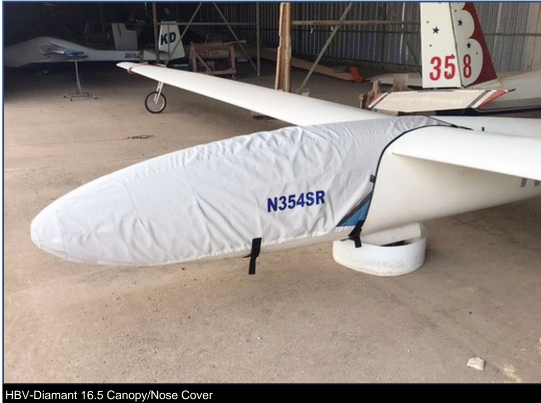
HBV-Diamant 16.5 Canopy/Nose Cover