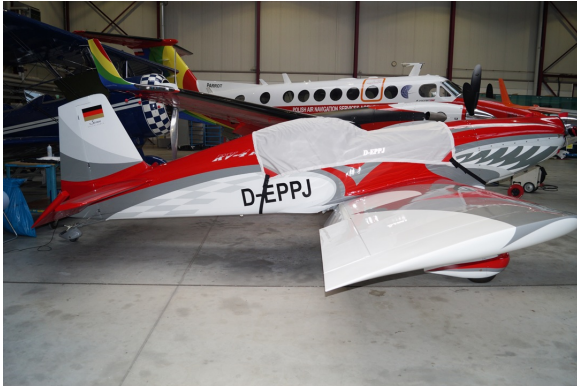
Harmon Rocket III Canopy Cover