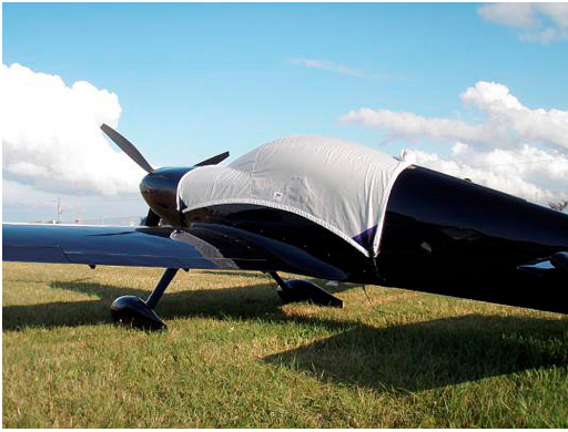
Harmon Rocket Canopy Cover

occasional use outside. We also have an ultra lightweight material available for fitted hangar dust covers. For daily outdoor use, the non-travel Sunbrella Cover is the best choice.