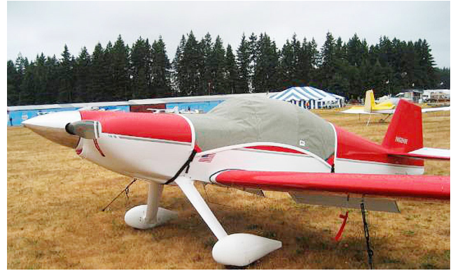
Harmon Rocket Canopy Cover & Engine Inlet Plugs