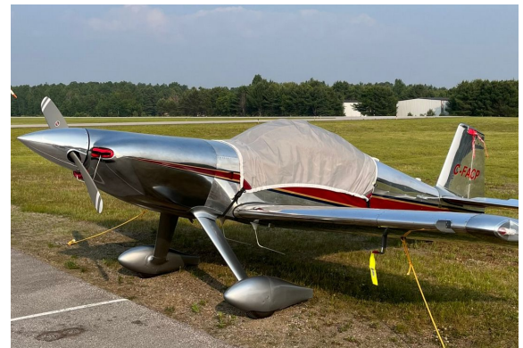
Harmon Rocket Travel Light Weight Canopy Cover Std Windshield