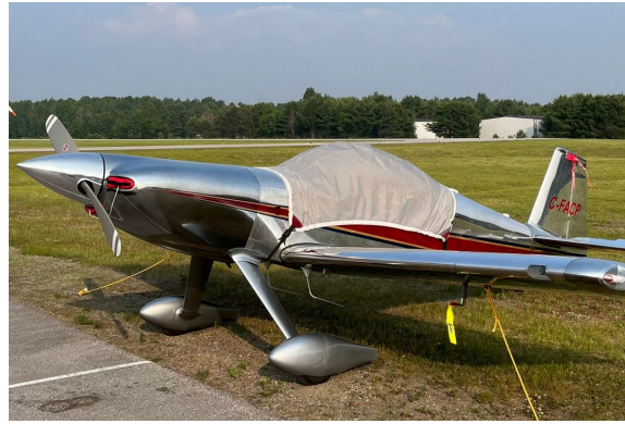
Harmon Rocket Travel Light Weight Canopy Cover Std Windshield