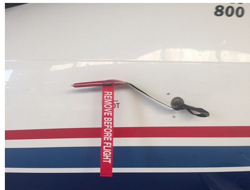
Hawker Beechcraft 800, 800XP, 850XP Pitot Covers With Aoa Straps

The Engine Inlet Plugs are custom fit for your Hawker Beechcraft 900XP intakes, made with heavy-duty vinyl material, and stuffed with a single block of sculpted urethane foam. Each plug has a zipper that allows the foam to be removed and dried if necessary. Engine plugs have 'remove before flight' streamers sewn onto the face of the plugs. Most plugs are imprinted with the aircraft registration number in black for an extra charge. Storage bag NOT included. Engine plugs may be inserted after flight when the engine is still warm. Engine Inlet Plugs are commonly referred to as Cowl Plugs, Intake Plugs, Cowl Blocks, Engine Blocks, and Engine Bunges.