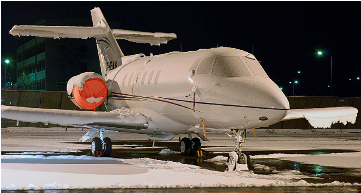
Engine Covers & Pitot Cover Set

instructions. The aircraft's registration number can be silkscreened onto the cover for an extra charge.