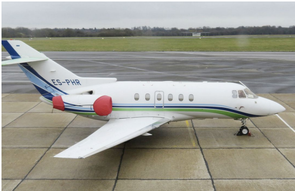
Hawker 750 Tri-Fold Engine Covers.