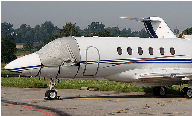
Hawker 800 Cockpit Cover