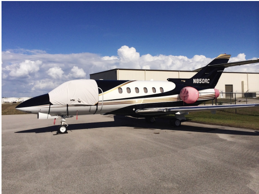
Hawker 800 Cockpit Cover, extended aft 24"