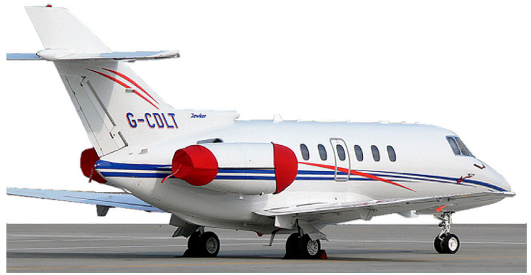
Hawker 800 Tri-Fold Engine Covers