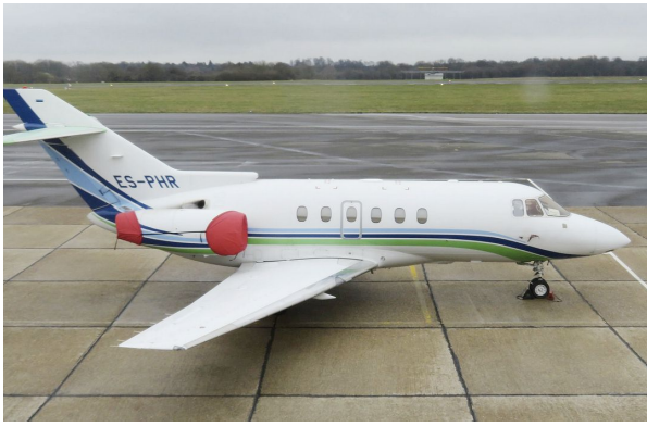
Hawker 750 Tri-Fold Engine Covers.