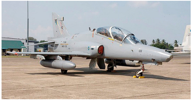
Covers, Plugs, HeatShields and related items for the British Aerospace Hawk 108