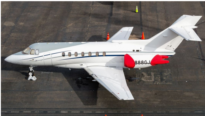
Hawker 1000 Engine Covers

The Hawker Beechcraft 1000 Intake Covers are designed to install easily yet be completely storable. A spring steel hoop is sewn into the hem of each cover, allowing them to be installed without climbing onto the wing or using a stepladder. To store the covers the spring steel hoop folds like a band-saw blade into three nesting rings. Each cover folds into a compact circular bundle which is stored in the included duffle bag, yet they unfold quickly for use. The Tri-Fold Ring cover is made of medium weight nylon which is available in a variety of colors to match the paint trim. Each cover set comes complete with installation and folding instructions. The aircraft's registration number can be silkscreened onto the cover for an extra charge.