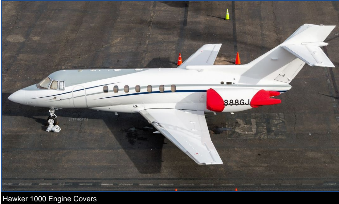
Hawker 1000 Engine Covers