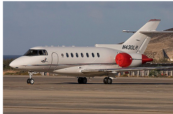
Hawker 1000 Engine Cover Set