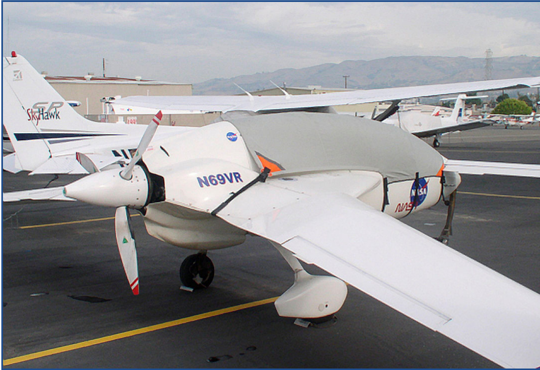
Speed Canard Canopy Cover, aft view