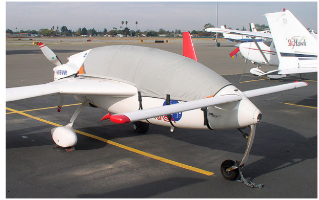
Gyroflug Speed Canard Canopy Cover