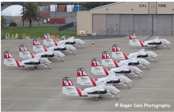
Grumman S-2 Tracker Canopy/Nose Cover