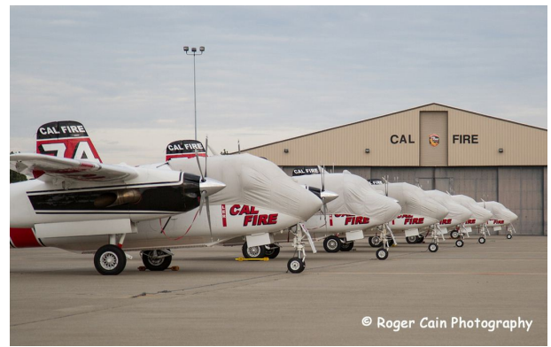
Grumman S-2 Tracker Canopy/Nose Cover