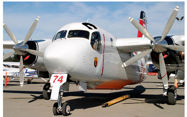
Grumman Tracker Engine Inlet Plugs