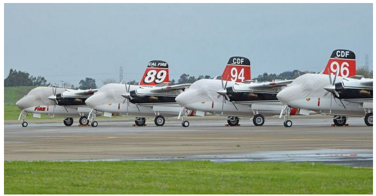
Grumman S2 Tracker Canopy/Nose Covers