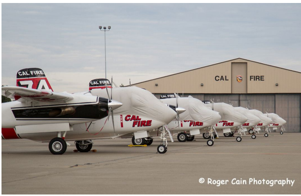
Grumman S-2 Tracker Canopy/Nose Cover