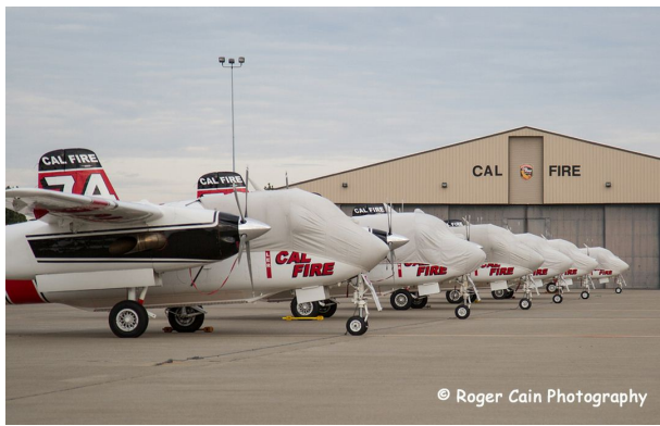
Grumman S-2 Tracker Canopy/Nose Cover