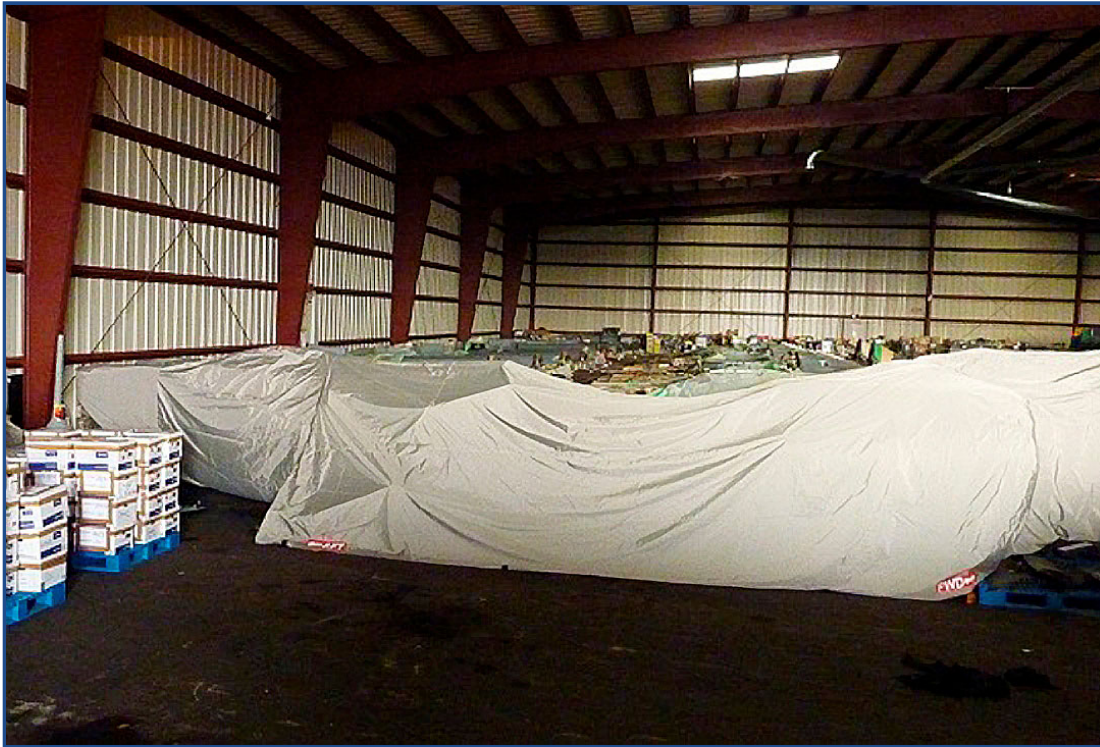
GR-7/9 FULL FUSELAGE COVER , NSN's: 1730-01-600-4557 & 1730-01-600-6757 (single seat shown)