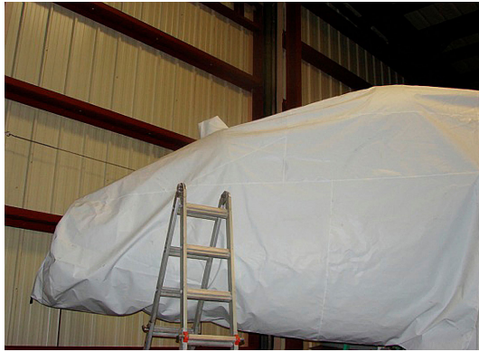
GR-7/9 FULL FUSELAGE COVER , NSN's: 1730-01-600-4557 & 1730-01-600-6757, dual seat

This cover type is made from Silver Acrylic Sunbrella canvas and is 100% lined with a soft and smooth microfiber. Bruce's Custom Covers developed this material combination especially for aircraft protection. The outer material is medium weight and treated for water resistance, UV resistance and anti-static buildup. The inner lining is a very soft and smooth microfiber to prevent scratching. The material is very reflective, and tests show that the cabin interior temperature can be reduced to near-ambient temperature on the hottest of days. It is water, ice and snow repellent, yet breathable to allow moisture to escape from between the cover and the aircraft surface.