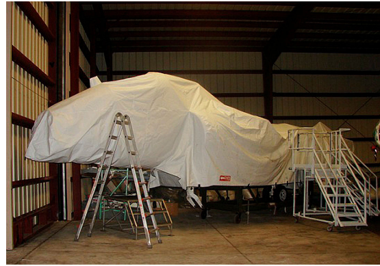
GR-7/9 FULL FUSELAGE COVER , NSN's: 1730-01-600-4557 & 1730-01-600-6757, dual seat