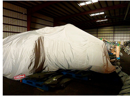
GR-7/9 FULL FUSELAGE COVER , NSN's: 1730-01-600-4557 & 1730-01-600-6757, single seat