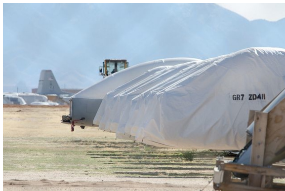
GR-7/9 FULL FUSELAGE COVER , NSN's: 1730-01-600-4557 & 1730-01-600-6757 (single seat shown)