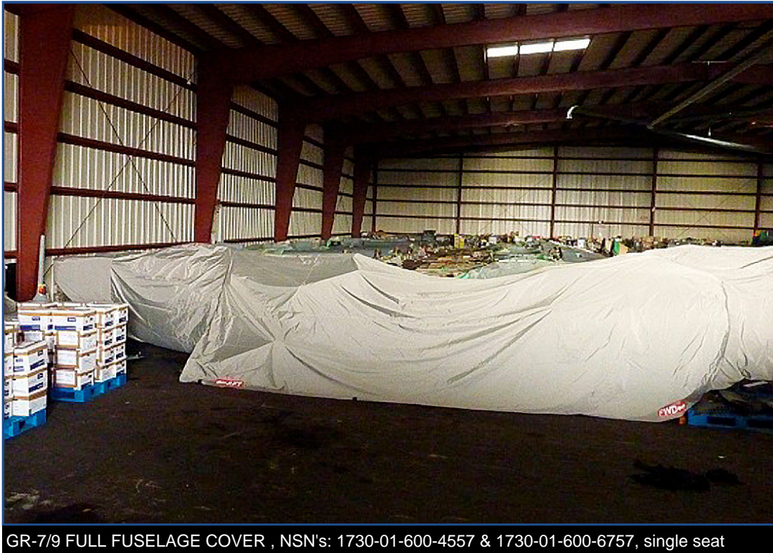
GR-7/9 FULL FUSELAGE COVER , NSN's: 1730-01-600-4557 &amp; 1730-01-600-6757, single seat