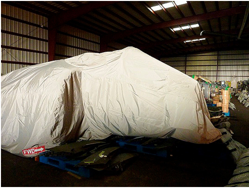
GR-7/9 FULL FUSELAGE COVER , NSN's: 1730-01-600-4557 & 1730-01-600-6757, dual seat GR-7/9 FULL FUSELAGE COVER , NSN's: 1730-01-600-4557 & 1730-01-600-6757, single seat