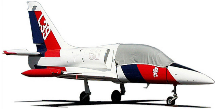
Canopy Cover for Aero L-39 Albatros