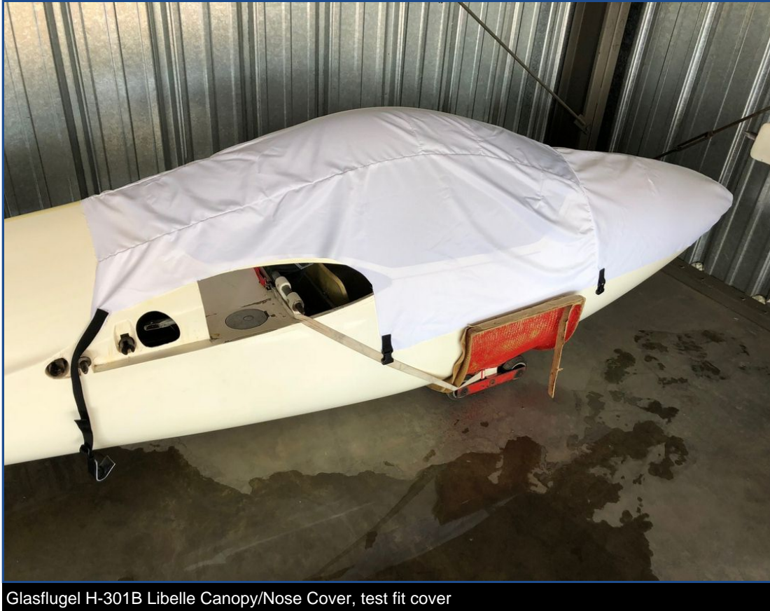
Glasflugel H-301B Libelle Canopy/Nose Cover, test fit cover