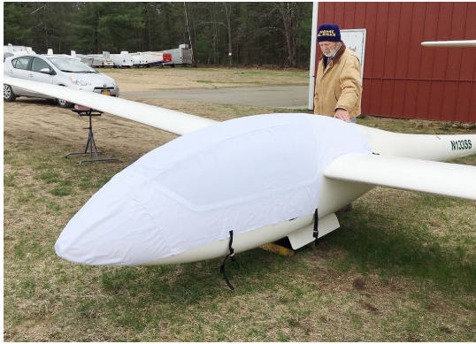
Grob 102 Astir CS Canopy/Nose Cover (test fit)

water resistance, UV resistance and anti-static buildup. The inner lining is a very soft and smooth microfiber to prevent scratching. The material is very reflective, and tests show that the cabin interior temperature can be reduced to near-ambient temperature on the hottest of days. It is water, ice and snow repellent, yet breathable to allow moisture to escape from between the cover and the aircraft surface.