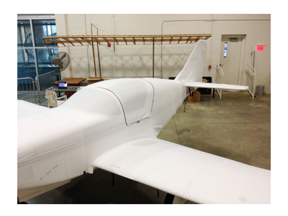
Glasair 2 Complete Fuselage/Wings Cover, test fit cover