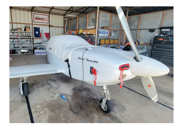
GLASAIR S2-RG Canopy Cover, Engine Plugs

Engine Inlet Plugs are custom fit for your Glasair Aviation Glasair II & III intakes, made with heavy-duty vinyl material, and stuffed with a single block of sculpted urethane foam. Each plug has a zipper that allows the foam to be removed and dried if necessary. Engine plugs have warning flags that are visible from the cockpit or 'remove before flight' streamers sewn onto the face of the plugs. Most plugs are imprinted with the aircraft registration number in black for an extra charge. Storage bag NOT included. Engine plugs may be inserted after flight when the engine is still warm. Engine Inlet Plugs are commonly referred to as Cowl Plugs, Intake Plugs, Cowl Blocks, Engine Blocks, and Engine Bungs.