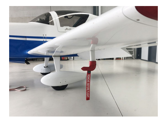
Glasair 2 Pitot Cover