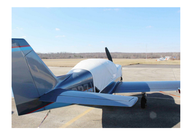
Glasair II Canopy Cover

This cover type is made from Silver Acrylic Sunbrella canvas and is 100% lined with a soft and smooth microfiber. Bruce's Custom Covers developed this material combination especially for aircraft protection. The outer material is medium weight and treated for water resistance, UV resistance and anti-static buildup. The inner lining is a very soft and smooth microfiber to prevent scratching. The material is very reflective, and tests show that the cabin interior temperature can be reduced to near-ambient temperature on the hottest of days. It is water, ice and snow repellent, yet breathable to allow moisture to escape from between the cover and the aircraft surface.