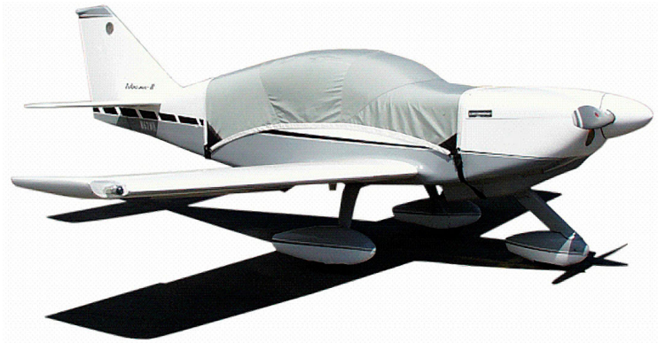
Canopy Cover for the Glasair I

Travel Covers are made with Silver Solution-Dyed Polyester fabric and only lined over the windshield to save weight. The material is lightweight and more compact for easy stowage in the aircraft. The polyester material is water resistant, but only intended for occasional use outside. We also have an ultra lightweight material available for fitted hangar dust covers. For daily outdoor use, the non-travel Sunbrella Cover is the best choice.