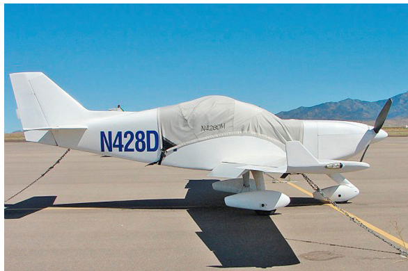
Glasair I Canopy Cover

This cover type is made from Silver Acrylic Sunbrella canvas and is 100% lined with a soft and smooth microfiber. Bruce's Custom Covers developed this material combination especially for aircraft protection. The outer material is medium weight and treated for water resistance, UV resistance and anti-static buildup. The inner lining is a very soft and smooth microfiber to prevent scratching. The material is very reflective, and tests show that the cabin interior temperature can be reduced to near-ambient temperature on the hottest of days. It is water, ice and snow repellent, yet breathable to allow moisture to escape from between the cover and the aircraft surface.