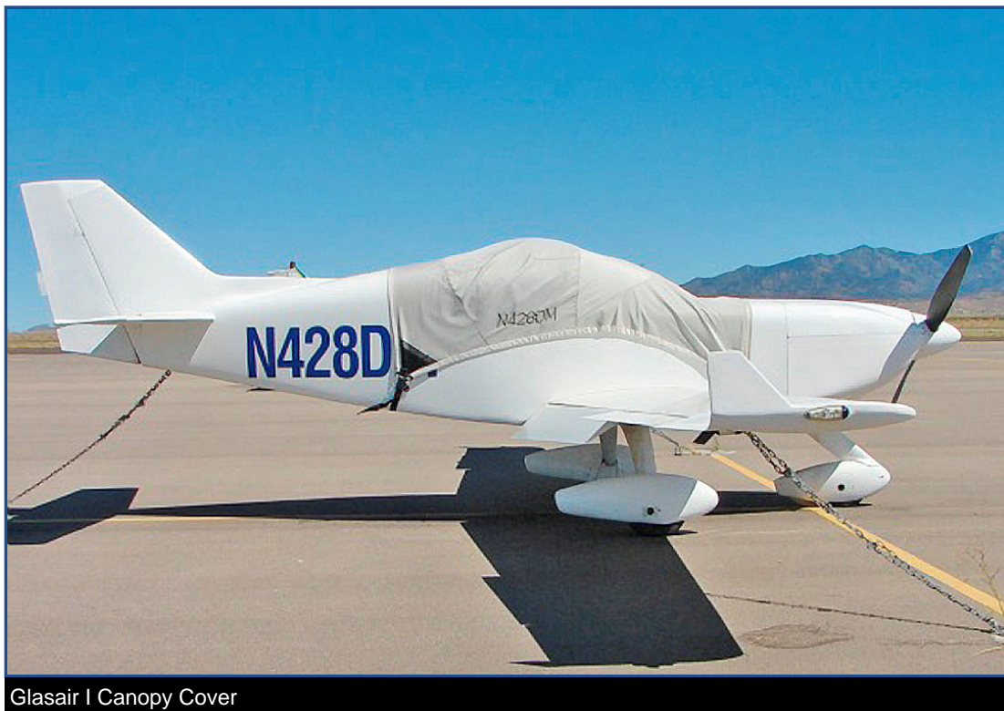
Glasair I Canopy Cover